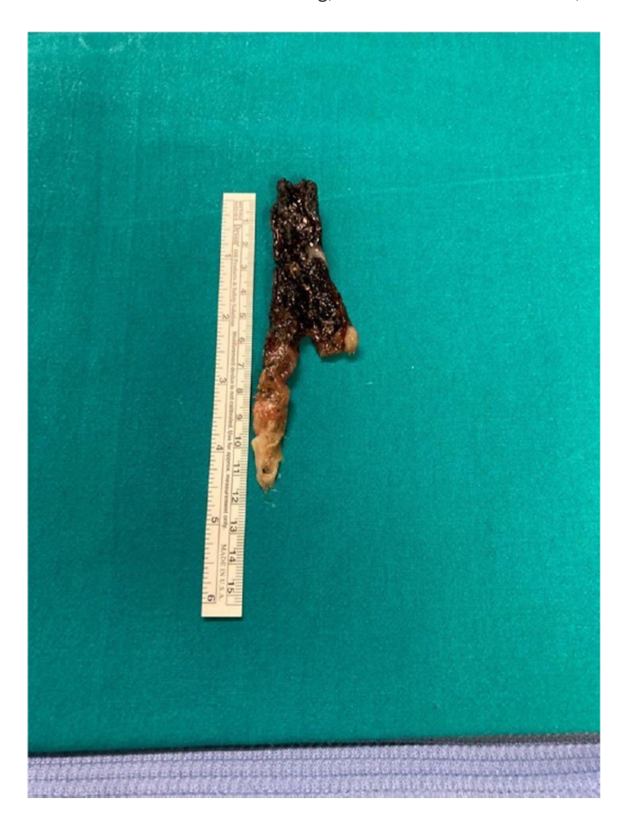
FIGURE 1 Tracheal plug. Bulky tracheal plug removed from patient #5, the procedure was performed by urgent rigid bronchoscopy

involvement due to tracheal obstruction and finally the management of tracheobronchial obstruction. The latter aspect needs special attention: due to the increased aerosolising risk, laryngectomees have the potential to become 'superspreaders' and transmitting viral particles to healthcare staff.<sup>3</sup> Evidences demonstrated that multidisciplinary team members (otolaryngologists, anaesthesiologists, emergency physicians, intensivists, nurses and speech therapists) treating patients with tracheostomy are at elevated risk of COVID-19 infection, with an odds ratio of 4.2.<sup>8</sup> Tracheostomy increases risk of aerosolisation because of the shorter distance from the high viral density alveolar surface to the stoma. When the circuit is disconnected for suctioning, nebulisation of medication, or