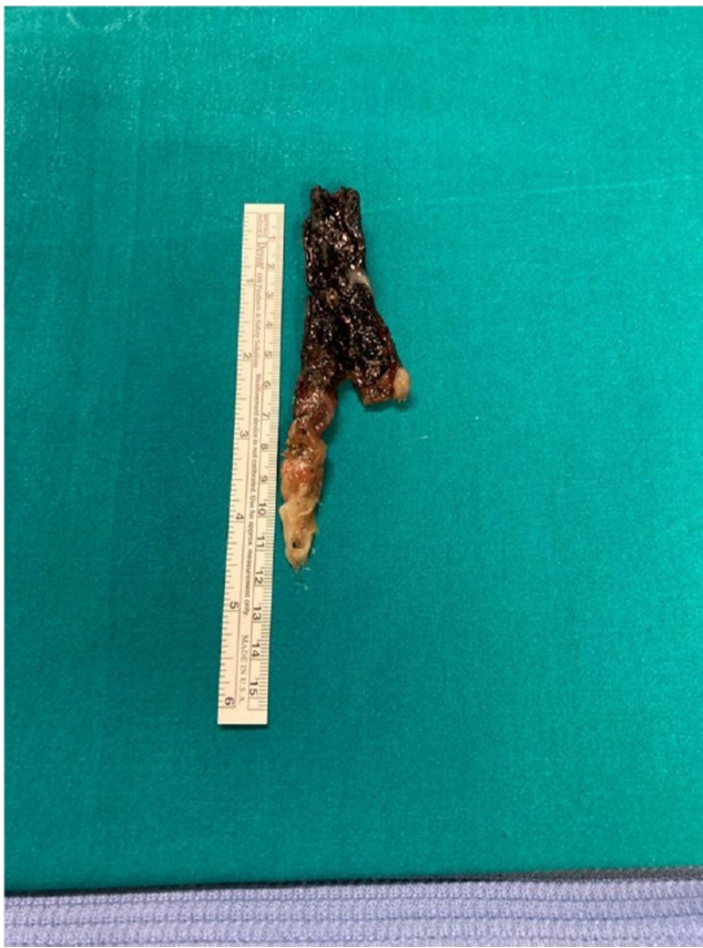
FIGURE 1 Tracheal plug. Bulky tracheal plug removed from patient #5, the procedure was performed by urgent rigid bronchoscopy

The present cases highlight the need for close interdisciplinary working and communication in the management of airway complications of COVID-19 infection. Careful joint planning between