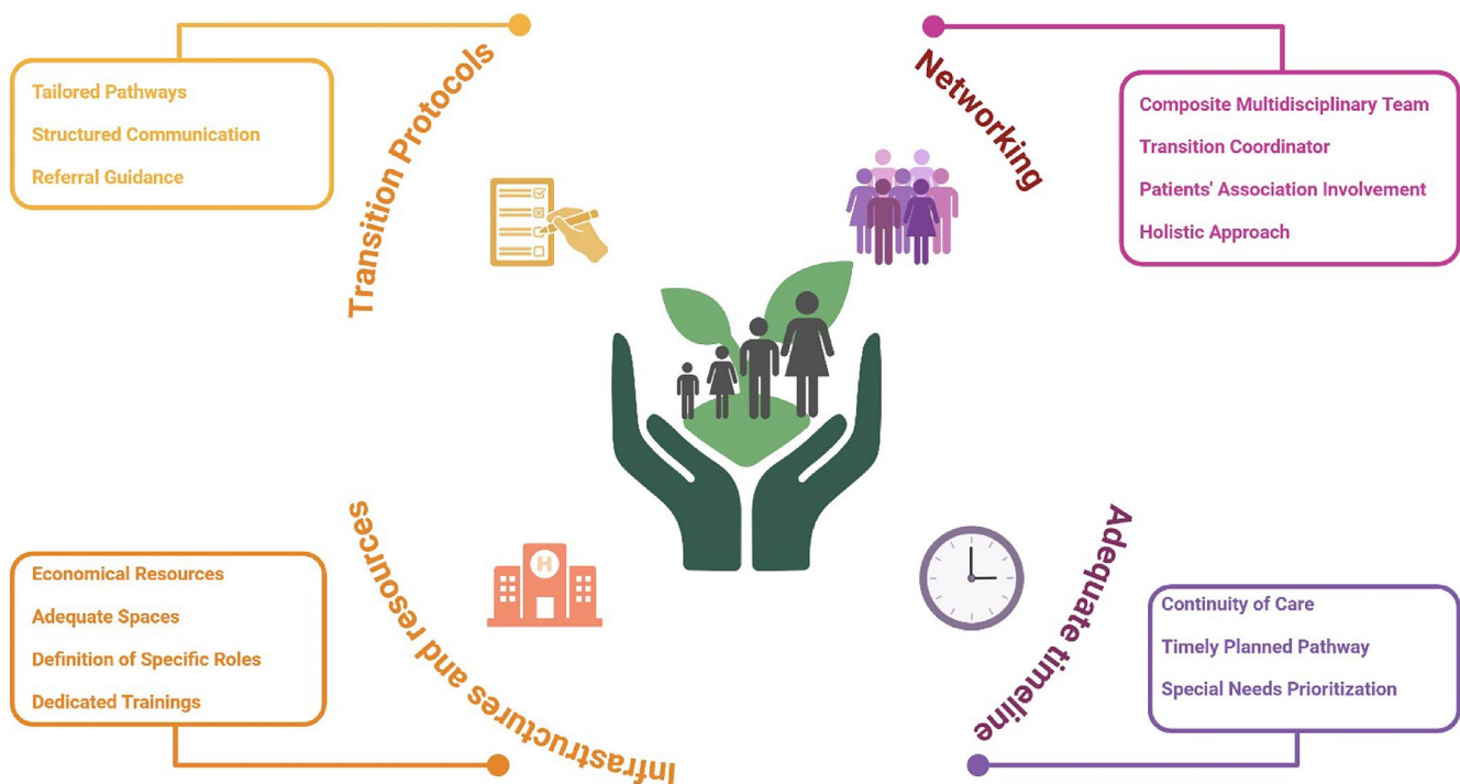
FIGURE 2 Successful transition smart figure. To effectively address the challenges of transition, future initiatives should focus on developing tailored and structured protocols. These protocols should integrate multidisciplinary care, including the involvement of a transition coordinator, as well as patients' associations and specialists such as psychiatrists, psychologists, rehabilitators, social workers, geneticists, and neurosurgeons, as required. The continuity of care should follow a timely planned pathway, coping with the special needs of patients. Additionally, the establishment of dedicated transition spaces and the allocation of financial resources by healthcare institutions and policymakers will enable the consistent delivery of high-quality transition services.

Factors recognized in our survey as delaying transfer are attachment and lack of adaptation, while pregnancy, driving license, and uncontrollable epilepsy accelerate the process. The observed discordances between pediatric and adult epileptologists reflect local trends and healthcare policies that undoubtedly create transition gaps even in tertiary centers. 15,25