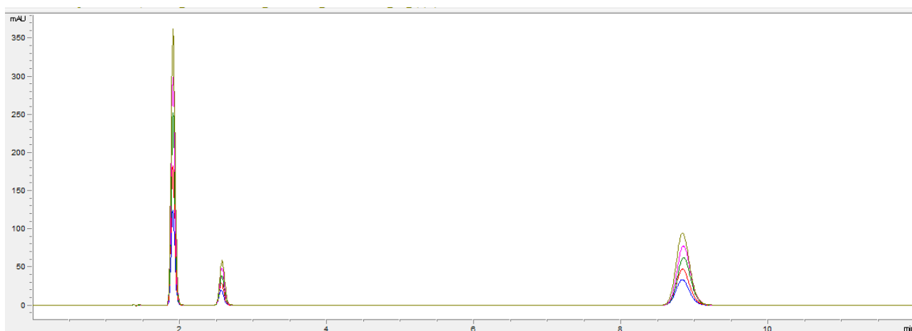
Figure S2. HPLC chromatograms for the calibration line of paracetamol (first peak at 1.9 min), caffeine (at 2.6 min), and acetylsalicylic acid (at 8.9 min).