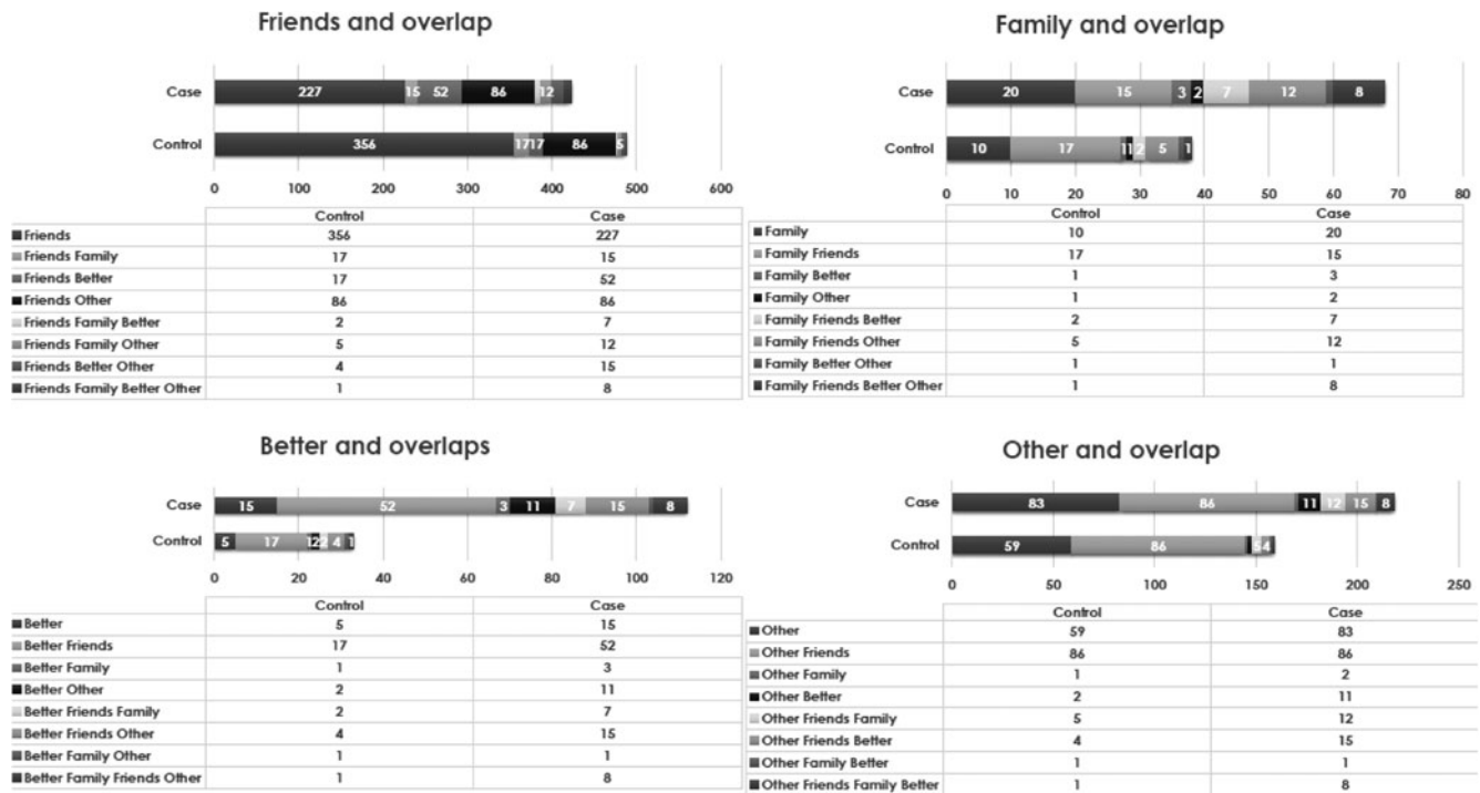
Figure 1. Overlapping reported RFUC in cases and controls.

or greater = 1 (see online supplementary materials for a detailed description of this variable). This combined measure was used to define the harmful pattern of use and coded as follows: occasional use with any potency of use = 1, more than once a week and low potency = 2, more than once a week and high potency = 3, daily or almost and low potency = 4, daily or almost and high potency = 5 (see online supplementary). Age at first cannabis use was considered as a continuous numerical variable.