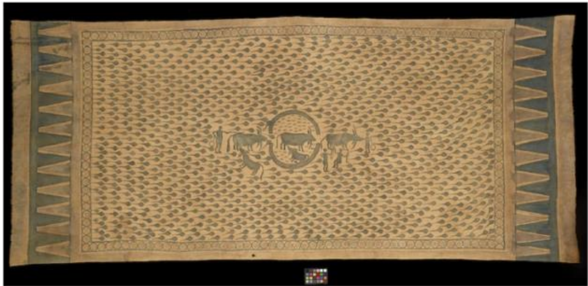
Figure 10. Old maa' with tadpole motif. The Dallas Museum of Art, The Steven G. Alpert Collection of Indonesian Textiles, gift of the Eugene M. McDermott Foundation. 1983.116. Notice also the passora' decoration at the border and compare it with the one on wood appearing in Figure 6.

In this sense, we may categorize the tadpole element as a performative symbol of prosperity. According to the perspective developed by Speech Act Theory (Austin, 1962), words not only name the world, but they actually perform what they name through the enactment of acts of speech. Similar to the performative function of magic spells and ritual formulas used by ritual speech specialists, these designs are not simply visual representation of an external reality, but graphic instruments aimed at calling their referents into existence, actualizing their users' expectations and desires for well being (T: pelambean). Thus, far from simply representing tadpoles as iconic symbols of abundance, the bulintong si teba' motif (often decorating the maa' and sarita hung from origin-houses during the performance of life-enhancing rituals) aims at bestowing abundance over the rice fields and bringing prosperity to the kindred group.