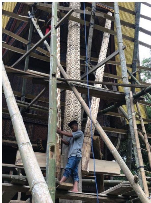
Figure 9. Lola' motif being carved on the pole of a tongkonan in Batutumonga.