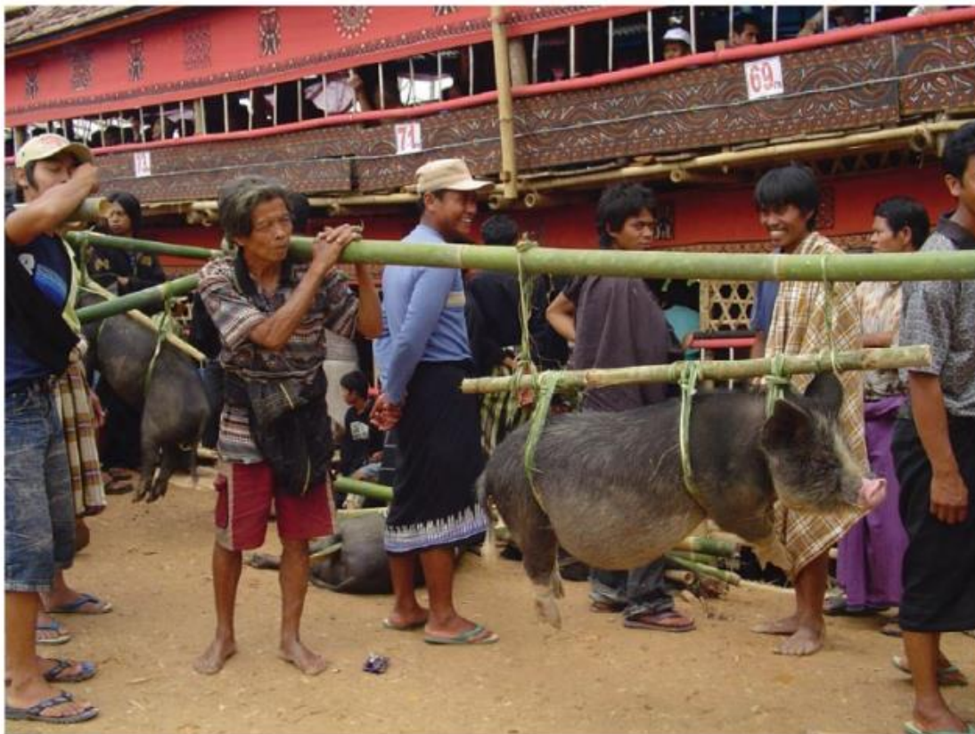
Figure 4. Digitally printed fabrics with traditional motifs adorn temporary shelter (T: lantang ) for hosting guests at a Toraja funeral.