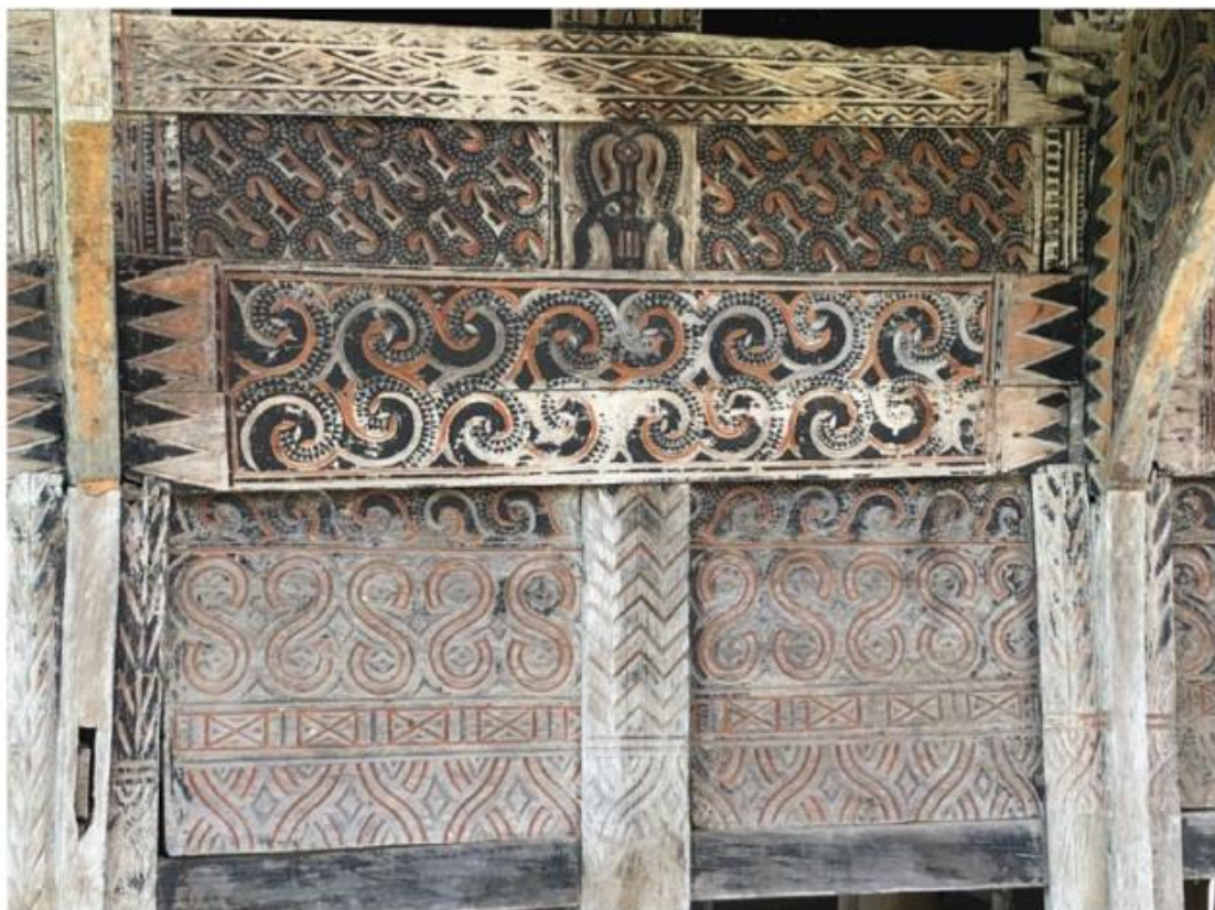
Figure 6. A Mamasan origin-house. The rows of triangles (a motif the Toraja call passora ) decorating the carving's borders are clearly derived from Indian textiles ( patola ).