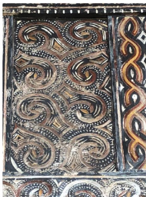
Figure 11. Stylized tadpole motif embellishing a tongkonan façade.