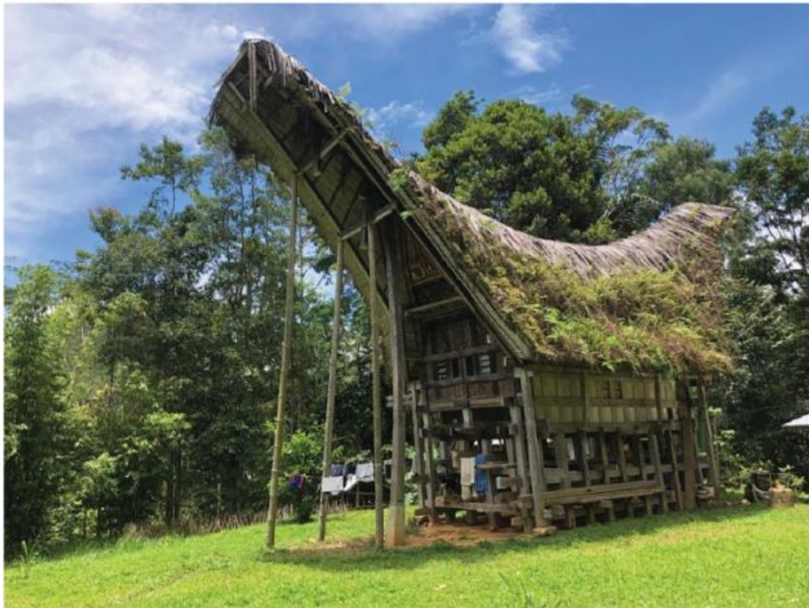
Figure 1. An old tongkonan in the district of Makale, Tana Toraja regency.

Based on the combination of a fluid cognatic kinship and a relatively rigid birth-determined rank system composed of four groups or stakes, the local forms of sociality pivot on inequitable agrarian relations of sharecropping, a patrimonial system of remuneration in kind, and a complex gift system based on the ritual exchange and slaughtering of pigs and buffaloes (Nooy-Palm, 1979; Volkman, 1985; Waterson, 2009). A key role in structuring social relations is played by origin-houses (T: tongkonan) (see Figure 1). As is the case in