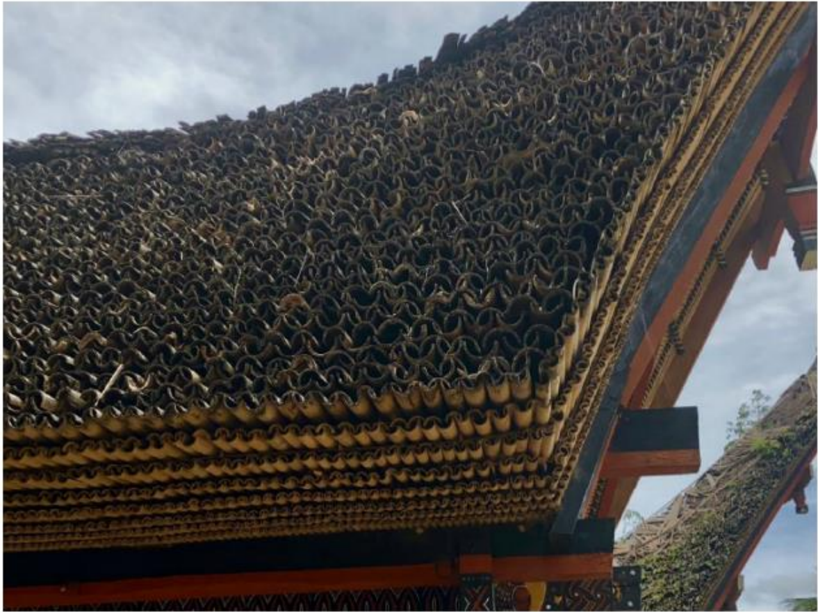
Figure 7. Bamboo roof illustrating the simuane tallang technique.

authorship. Conceived as the ‘words of the ancestors’ (T: kada-kada to dolo), ritual speech draws its authority from its alleged ancestral origin and from the deployment of formal linguistic features that allow the speakers to downplay responsibility for what they say. As Kuipers (1998: 71) observed in Sumba, the ritual register’s formal features (i.e. lack of verbs of saying and personal pronouns, minimal use of spatial and temporal deixis, etc.) contribute to ‘detach discourse from the immediate constraints of utterance and attach it to a shared, coherent, and authoritative tradition’.