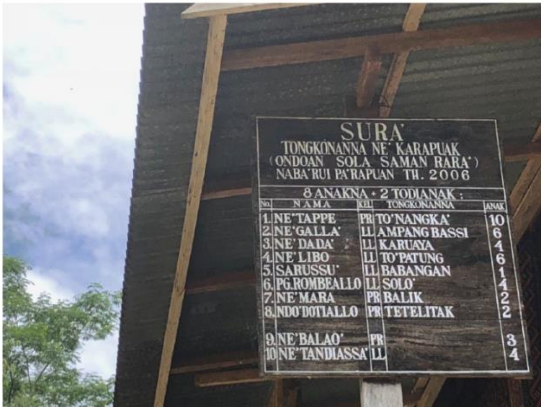
Figure 2. Tongkonan Sura', in Balik, Sangalla' district. The photo shows the detail of a plank attached on the house façade listing the descendants who took part in the house renovation ceremony.

other 'house societies' (Lévi-Strauss, 1983[1979]), the tongkonan functions as a conceptual and material device that links different generations. Established to celebrate the marriage of a founding couple and its descendants, origin-houses are generally inhabited by a family, a couple, or a representative of the group of living descendants – the pa'rapuan. This kinship group is commemorated through the physical structure and the ritual feeding of the origin-house, which entails the offering of cuts of meat from the ritually slaughtered animals (Figure 2).