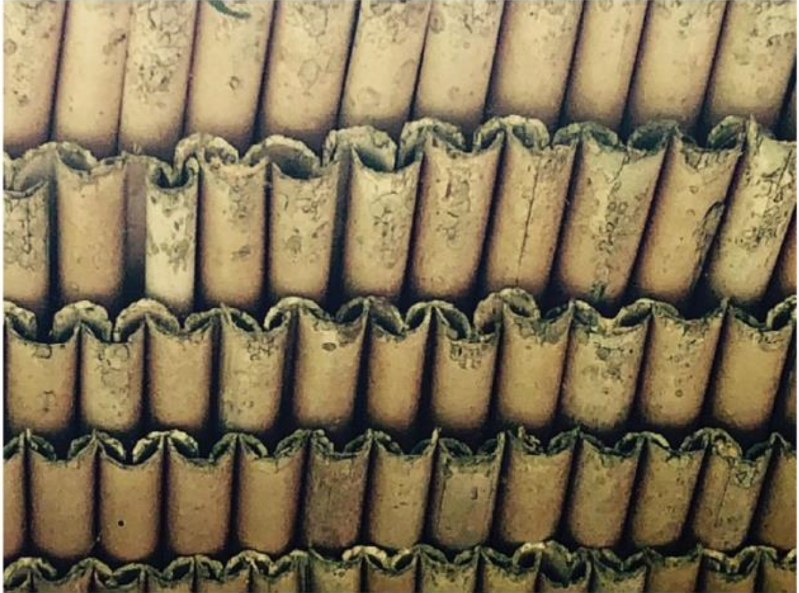
Figure 8. Simuane tallang roof detail.