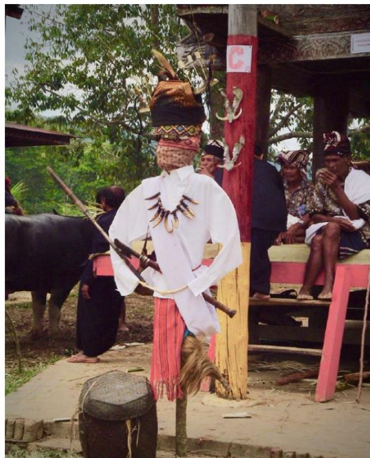
Figure 3. At an aluk funeral in Balik, a sacred cloth is wrapped around the head of a temporary effigy of the deceased.