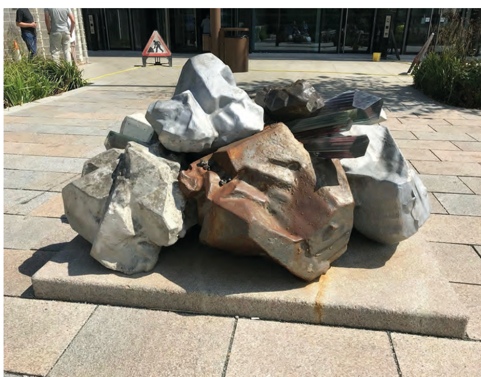
Figure 7. 'Every Increased Possession Loads Us with New Weariness', Sculpture by Revital Cohen and Tuur Van Balen.

They follow a bottom-up, people-centred approach; it is in the palimpsest of stratified actors, objectives, artefacts, and hopes that muf digs and connects dots to eventually give a space and a time to every relevant and representative element of the place. This approach of 'close looking' to the place makes evident specific contextual histories and uses and let muf unveil the latent potential of the place and how it can be transformed for the benefit of the local communities.