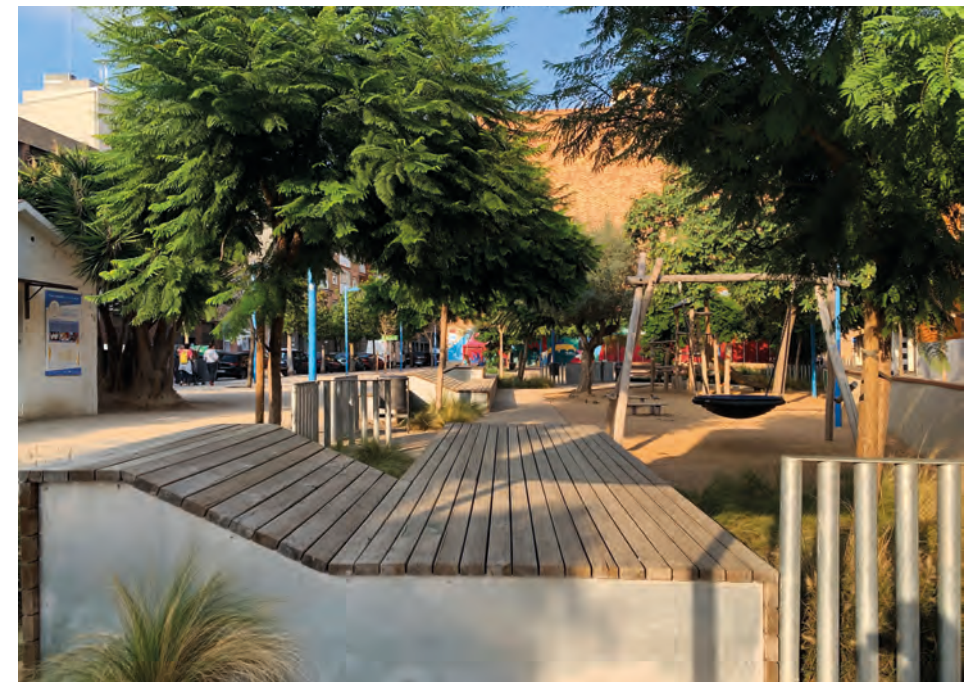
Figure 3. Plaça d'en Baró.