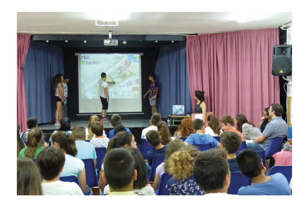
Figure 2. Children presenting their project to the City Council and the community.

of the borough for which developers and owners were still awaiting permission to build.