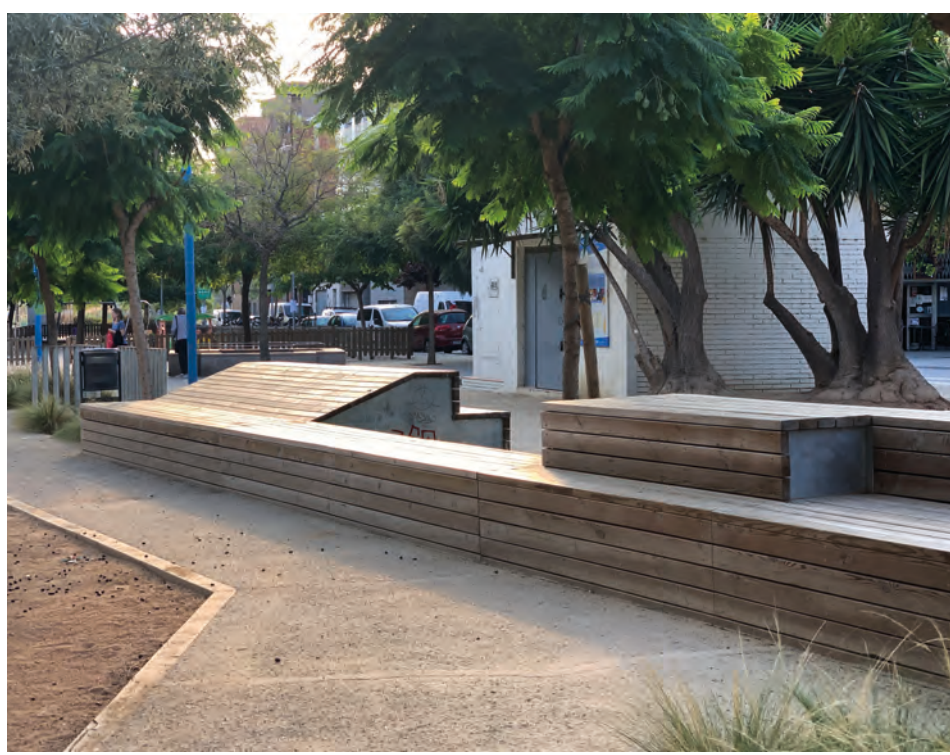
Figure 4. Platforms in the 'Caring City' in Plaça d'en Baró.

children but also in their caregivers, usually women, and therefore engages in the conversation two distinct and interconnected vulnerable groups usually left out of the conversation.