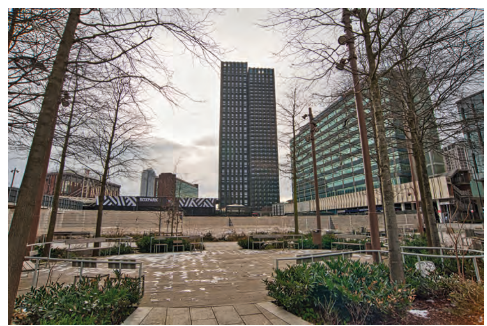
Figure 6. Seating area in Ruskin Square recalling the oval chamber in which Ruskin has taught for many years in the nearby adult college.