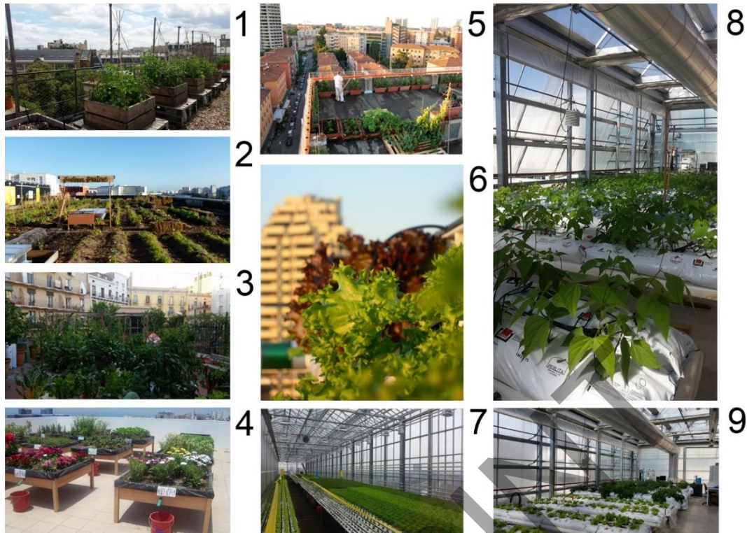
Figure 4. Examples of rooftop farms. Open-air rooftop gardens : (1) AgroParisTech (Paris, France); (2) Post office La Chapelle (Paris, France); (3) Kitchen rooftop garden in Barcelona at residence of Joan Rieradevall Pons (Barcelona, Spain); (4) Therapeutical rooftop garden managed by IRTA (Barcelona, Spain); (5) and (6) Rooftop garden in social housing buildings of Via Gandusio (Bologna, Italy); (7) Rooftop aquaponic greenhouse at UrbanFarmers (The Hague, The Netherland); (8) and (9) The experimental integrated-Rooftop Greenhouse (i-RTG) at IRTA (Barcelona, Spain).