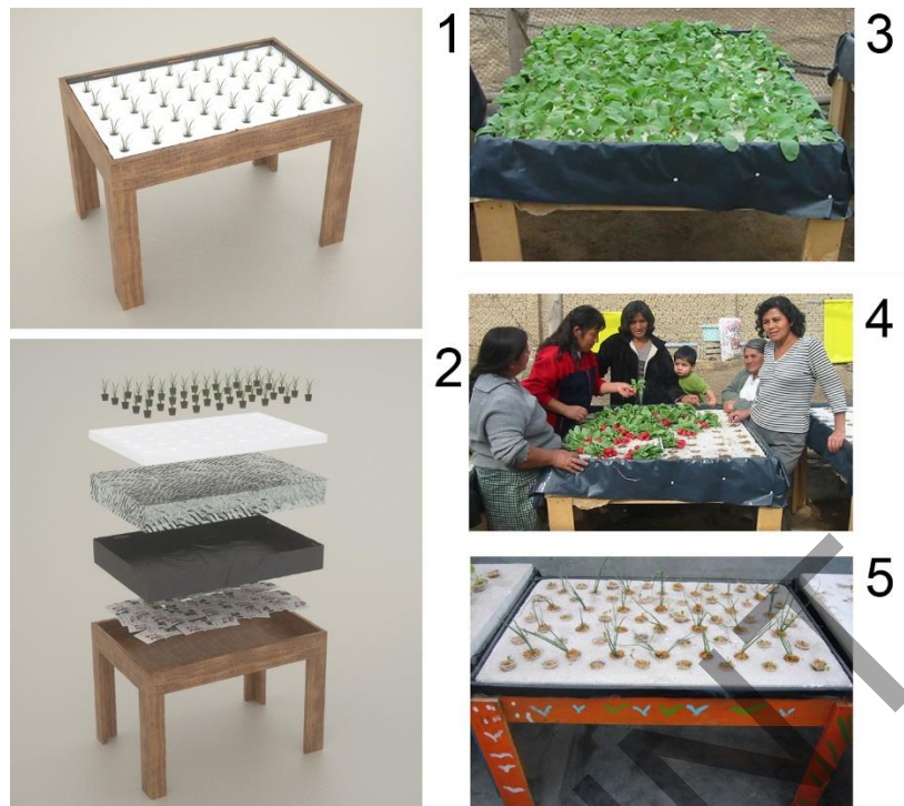
Figure 1. The simplified floating system. (1) Rendering of the system and (2) exploded system design. (3) Images of simplified substrate growing systems in the cities of (4) Trujillo (Peru) and (5) Lima (Peru).