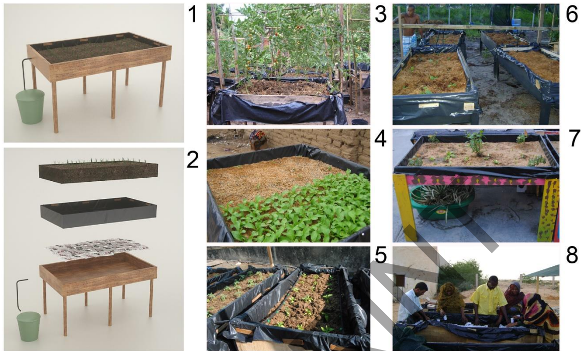
Figure 2. The Simplified substrate growing system. (1) Rendering of the system and (2) exploded system design. Images of simplified substrate growing systems in the cities of (3) Teresina (Piaui, Brazil), (4) Trujillo (Peru), (5) Abidjan (Ivory Coast), (6) Boipeba (Bahia, Brazil), (7) Lima (Peru) and (8) Tidjikja (Mauritanie).

Cold War determined severe issues concerning food security (Altieri et al., 1999). Ever since, the successful application of organoponics continued until now, counting more than 200 cases and providing half of fruit and vegetable needs to Havana residents (Orsini et al., 2013).