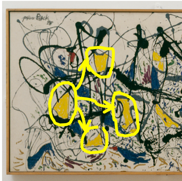
Fig. 3 Deformations of yellow regions in Summertime n.9 by Jackson Pollock