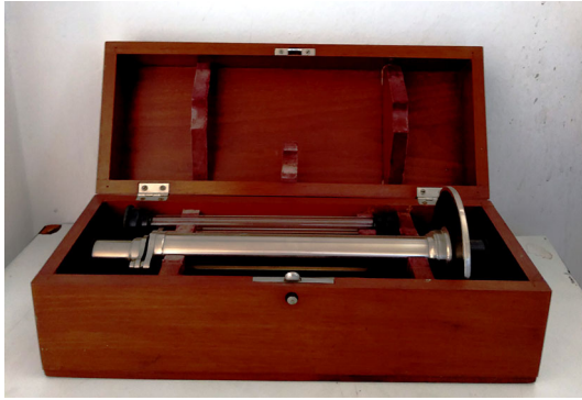
Fig. 3. One the optical tubes in the Physics Collection of Bologna, captioned as “Reflector Poggendorff Scale” but identified instead as a saccharimeter.

instruments such as magnetometers or galvanometers, a mirror is attached to the mobile element of the instrument and observed through a telescope. Perpendicular to the axis of the telescope, above it, is placed a rule with zero at the centre. On the mirror a beam of light is sent so that it is reflected on the scale, on which a very bright spot is visible. When the mobile element moves, the light beam is reflected to the right or left of the zero of the scale. If the mirror rotates by a certain angle, the rays reflected on the scale have double angular deviation (Figure 4).