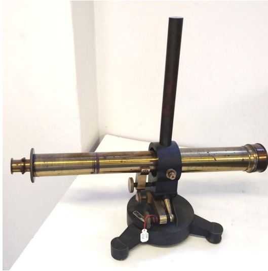
Fig. 5. The reflector Poggendorff scale of the Physics Collection of Bologna.