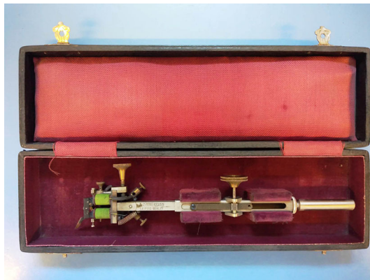
Fig. 6. Electromagnetic signal from Deprez of the Physics Collection of Bologna.

Other instruments will require more accurate measurements and small experiments in a laboratory space. This is the case of a phosphoroscope and of a series of vials with liquid dyes, used in spectroscopy, and with powders, used in microscopy.