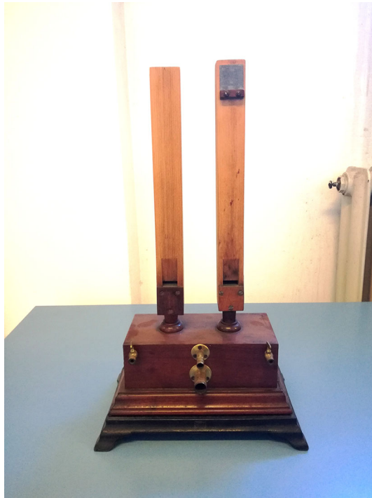
Fig. 7. Incomplete apparatus for the comparison of the vibrations of two air columns of the Physics Collection of Bologna.

Among the series of well-known and easily-identifiable acoustics instruments there was one that turned out to be largely incomplete and therefore problematic. It appeared as a system of two simple organ pipes with the caption: “Two acoustic tubes: Fa4, Do4.” The presence of a box on which the tubes are fixed has been fundamental to correctly identify the apparatus. A joint use of the two tubes in a common experiment is suggested, specifically the comparison of the vibrations of two air columns (Figure 7).