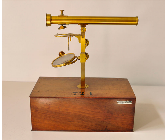
Fig. 1. The catadioptric microscope of the Physics Collection of Bologna, signed by Amici.

The microscope of the Physics Collection in Bologna bears the engraving “Amici Modena” and can therefore be considered one of the most valuable pieces of the collection; Amici’s signature and comparison with the catadioptric microscopes kept in other museums made the identification unequivocal.