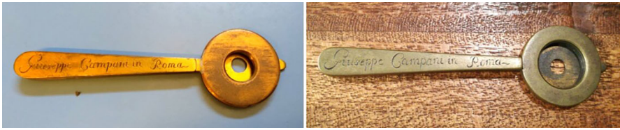
Fig. 9. Modern reproduction of the apparatus signed by Campani, found among the nineteenth-century instruments of the Physics Collection of Bologna (on the left), and of the original apparatus kept at the Museum of Palazzo Poggi (on the right). The engraving reads: “Giuseppe Campani in Roma.”

instrument whose replica has been found in this study and whose original is kept at Museum of Palazzo Poggi, even though the lens is not present anymore.