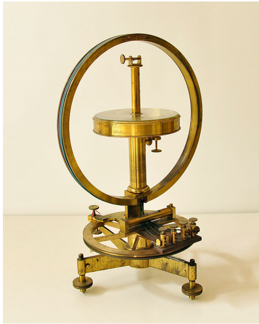
Fig. 2. One of the two compasses of the sines and of the tangents of the Physics Collection of Bologna. The instrument bears the signature of Heinrich Ruhmkorff.