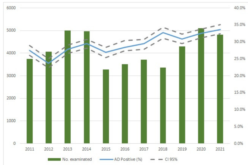
Figure 2. Number of wild boars examined per year and trend in the percentage of AD seroprevalence from 2011 to 2021.