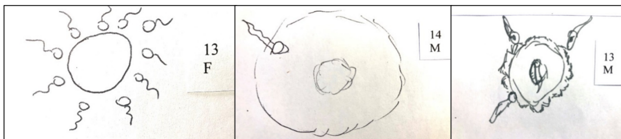
Figure 4 Student drawings: egg membrane

The language in the descriptions of fertilization that accompany the drawings reinforces the notion of a passive, floating egg, as in, “the ovum is still and the spermatozoa enter.” Verbs highlighting the sperm's active efforts include “arrives,” “enters,” “tries to,” “goes” [through/into/towards], “exits,” “heads for,” “traverses,” “travels,” “reaches,” “leaves,” “fertilizes,” “produces,” and “penetrates;” more passive verbs include “happen,” “occur,” “be let into,” and the reflexive “mature.” Many of the descriptions grant agency and individuality to the sperm, as in “Those which will