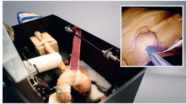
► Fig. 1 ERCP anatomic bench model.

Three experienced endoscopists (> 5 years of practice) were recruited from the Gastroenterology and Interventional Endoscopy Unit of Local Health institution of Bologna. Current and previous musculoskeletal disorders were assessed using a standardized questionnaire including The Italian version of The Nordic Musculoskeletal Questionnaire [7]. Individuals were also