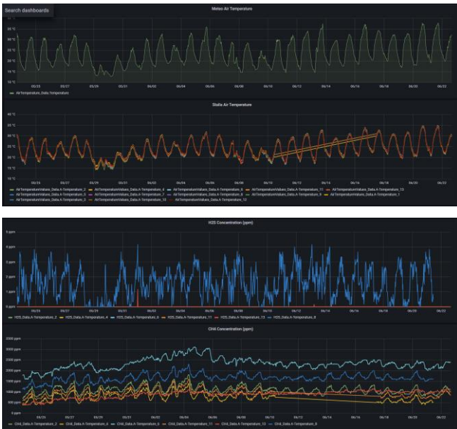
Fig. 3. Some images of the graphical interface in Grafana used to manage the nodes and the gateway of the SMS.

This aspect provides useful indications suggesting that in the monitored period in a significant number of hours the value of methane concentration recorded in the barn exceeded the alert threshold. On the basis of these considerations, the ventilation systems should therefore in future also be operated on the basis of undesired gas concentrations in the livestock barn.