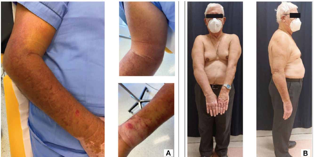
Figure 2. A) Patient's right arm. Note the arm size, which was more than twice the contralateral, causing the patient difficulties in flexing the arm and swelling, with the appearance of orange peel skin; B) patient after six months of treatment with methotrexate and the use of the elastic compression device. Note the significant reduction in the volume of the affected arm and the skin appearance, now much more similar than the unaffected one.