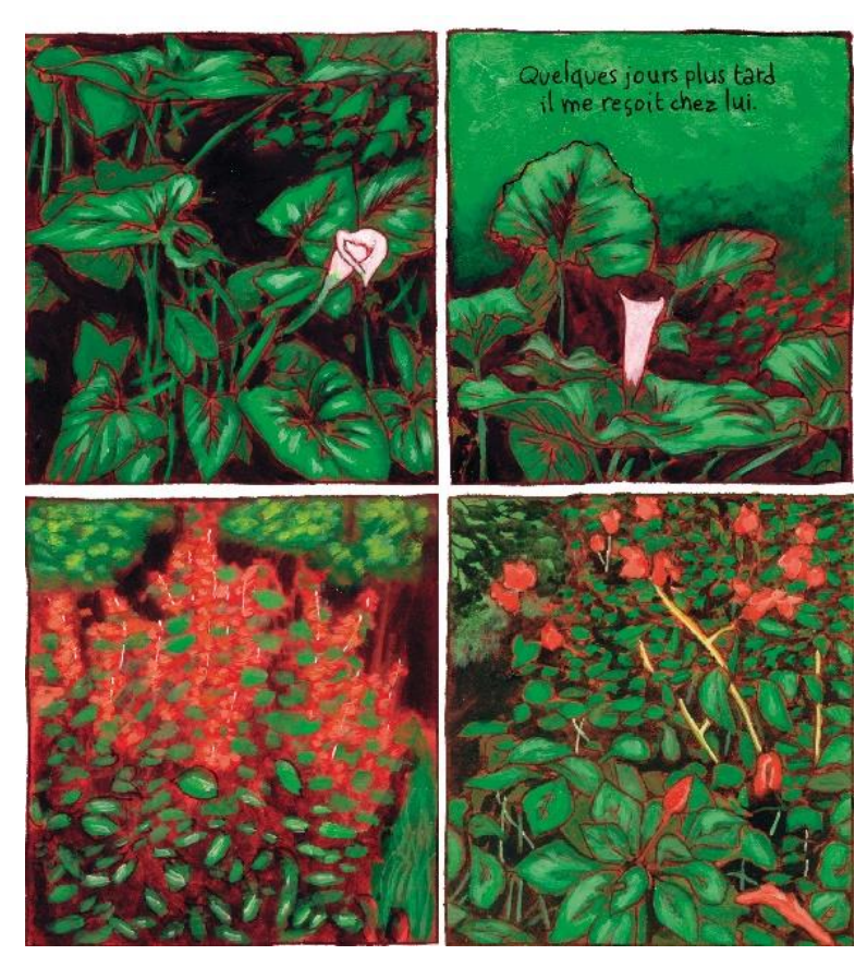
Figure 2: Baloup, Clément, Quitter Saigon, 3rd edition, La Boîte à bulles, 2016, p. 23.

play with a rhythm, accelerating and slowing down the story. The visual narration regularly pauses to focus on marginal (sometimes even lyrical) elements that do not make the story progress. This stasis is often obtained through images imitating the style and/or content of (post)impressionist paintings (Fig. 2).