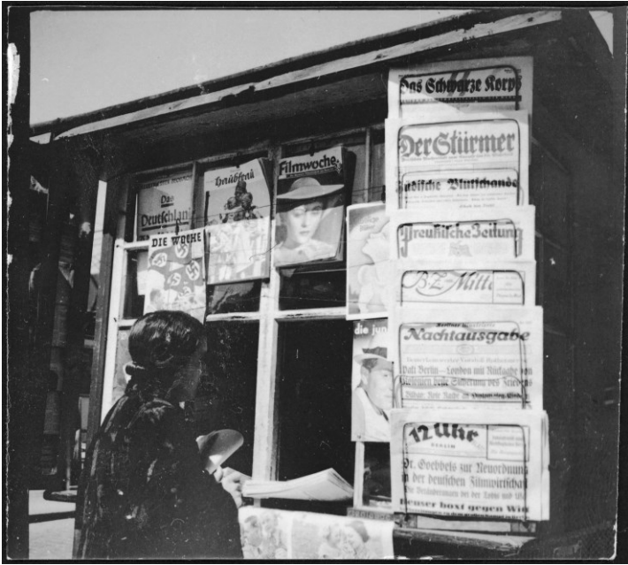
Fig. 5a; Fig. 5b