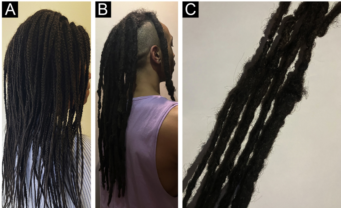
Fig. 2 A case of traction alopecia due to a tight hairstyle, pre (A) and post (B) hair transplant.

as strands may become tangled and knotted, resulting in breakage when attempting to detangle the teased hair. In addition, this technique can lift the cuticle layer, exposing the cortex and making the hair shaft more prone to damage. Furthermore, the significant force and manipulation involved in backcombing can ultimately lead to TA. Finally, when combined with hairsprays or heat styling tools, backcombing can cause hair weathering if not done with care. 7,8,43,60,61 There is a condition, known as bubble hair deformity, characterized by the formation of air cavities within the hair cortex, primarily affecting females, that may be related to backcombing as well as any hairstyle involving heat styling tools. It is typically associated with the prolonged exposure of damp hair to high temperatures generated by blow dryers or styling devices. The high temperature causes hydrolysis of keratin within the hair shaft, leading to local air expansion and the formation of bubbles. While most reported cases of bubble hair deformity involve Caucasian patients, it has been suggested that there may be ethnic differences in susceptibility to this condition: for example, Asian hair has been shown to exhibit significantly more heat-induced protein loss compared to Caucasian hair, potentially due to structural differences in the hair cortex. 62