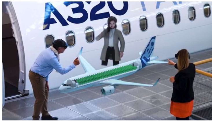
Figure 2: Industry-first concept based on Mixed Reality technologies for Cabin Customisation and Design for the A320 Family (courtesy of Airbus 1 ).

In the design and development phases, rather mature applications are established in the field of synthetic visualization which allow for a better understanding of the performance achieved by a certain design solution 2 . Furthermore, XR has proven to be beneficial for collaborative design, design reviews and user assessment throughout the product development process [3]. This application is still in the early stages of research, begin now developed as a proof of concept [4]. One of the biggest opportunities provided by XR is the one of including user feedback in the design process, as proved in a study conducted to virtually test the comfort of newly conceived aircraft cabin designs. Not only the project exploited V/AR technology to validate the proposed design approach and strategy in the design of aircraft cabins, but it demonstrated how XR can be a useful tool, starting from the very early stages, to the entire process which results to be more open and flexible, time efficient and cost-effective [5]. As a matter of fact, early stages of design, when prototypes are still in the digital phase, are ideal for leveraging eXtended Reality technologies. Recent research 3,4 [6], makes use of advanced VR technologies to enable the different stakeholders to experience and be immersed in the full scale design, allowing them to be involved in the process starting from the Inspiration and Ideation Phase [7-8].