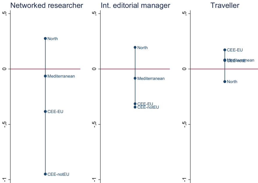
Fig. 1 The three types of international political scientists, by geographical area. Note: standardised values (1 means one standard deviation above or below the average).