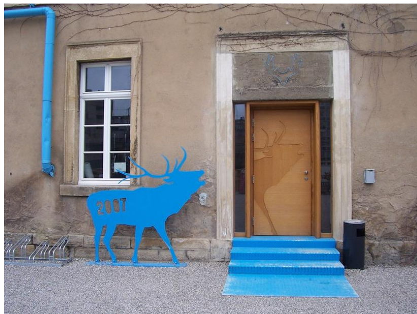
Figure 4. Steel cutout of the Luxembourg 2007 logo by the city's European Capital of Culture headquarters.

At the same time, in an interview I conducted with the communications manager for Luxembourg 2007, she said: “Rebuilding the image of Luxembourg is at the very core of Luxembourg 2007: from outside, Luxembourg is mostly seen as ‘banks,’ so we want to make something new and reactivate creativity.” As a country with one of the largest GDPs per capita in the world, Luxembourg had a budget of €7,000,000 for communication related to the European Capital of Culture alone, and focused on spreading its brand image across the city. For this reason, a plethora of steel cutouts of the whimsical Luxembourg 2007 logo, a blue deer, were strategically placed by major city buildings, in addition to the European Capital of Culture headquarters (Figure 4). The blue deer were sponsored by ArcelorMittal, the world's largest steel company with headquarters in Luxembourg, which was one of the major partners of Luxembourg 2007. In Luxembourg, the hyperbranding extended to street lighting and the 54 types of different branded products that were developed for Luxembourg 2007, with two new products being introduced every month based on the time of the year like, for example, gloves for the winter, and flip-flops for the summer.