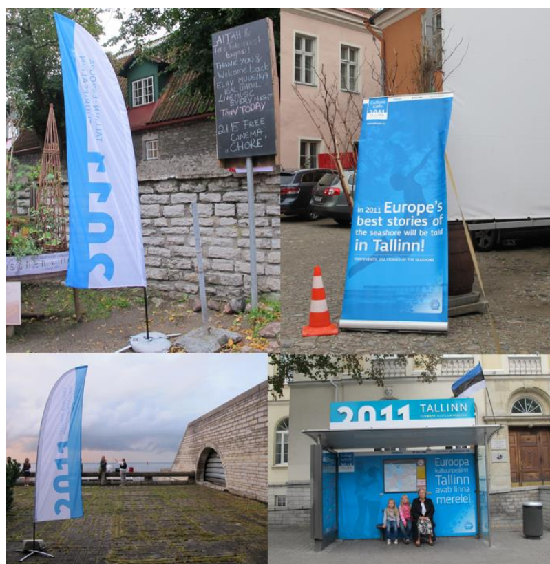
Figure 5. Moveable banners and structures with Tallinn 2011 branding.

This aestheticized signposting of private development in both cities tells us something about the importance of each European capital of culture as a temporary performative stage for lasting corporate business. While the European Capital of Culture title comes with European Commission funding for the required yearlong cultural exchanges and activities, this is also a scheme that aims to “boost” local economies through urban regeneration plans to be fueled both by public and private investment. It is therefore also and foremost by paying attention to both cities’ aesthetics that we can understand this problematic entrenchment of “light” cultural policy and “heavy” globalist capital.