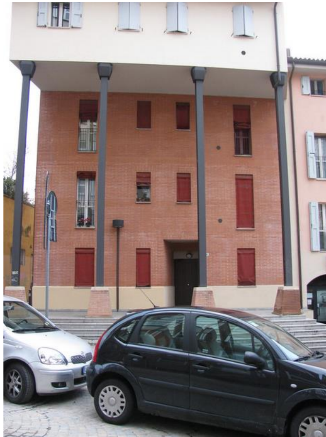
Figure 6. Layering of contemporary and historic architectural details in Bologna's Manifattura delle Arti student housing.

Another example of this kind of layering can be observed in the former slaughterhouse's outdoor space (Figure 7). Here, public seating made of dark teak on a brushed metal structure is set against the background of an historic building, featuring a red brick wall with yellow plaster trims and arched windows. This arrangement is made even more deliberate by the symmetrical framing of the three pieces of public furniture against the two original windows. The resulting effect of juxtaposition is striking and distinctive, but also familiar and generic. It is through such juxtaposition of stylistic references that Manifattura delle Arti is made to "look like" historic Bologna, while also performing a cosmopolitan identity. Reconverted districts like this mobilize semiotic resources that balance local and global identity traits. In doing so, they maximize on the symbolic profitability of distinction—from the surrounding neighbourhood, from the rest of the city, and from other cities—within prized formats of urban design.