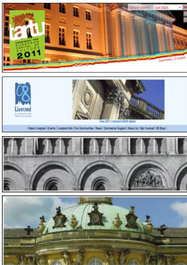
Figure 2. Metonymic architectural details in banners for the official websites of Tartu 2011, Liverpool 2008, Pécs 2010, and Potsdam 2010.

also work to reinscribe the notion that culture may be reduced to “high culture” and to these material artefacts, spaces and practices. At the same time, these are all actual “buildings” and “places” that can be visited while in the city (Aiello and Thurlow 2006).