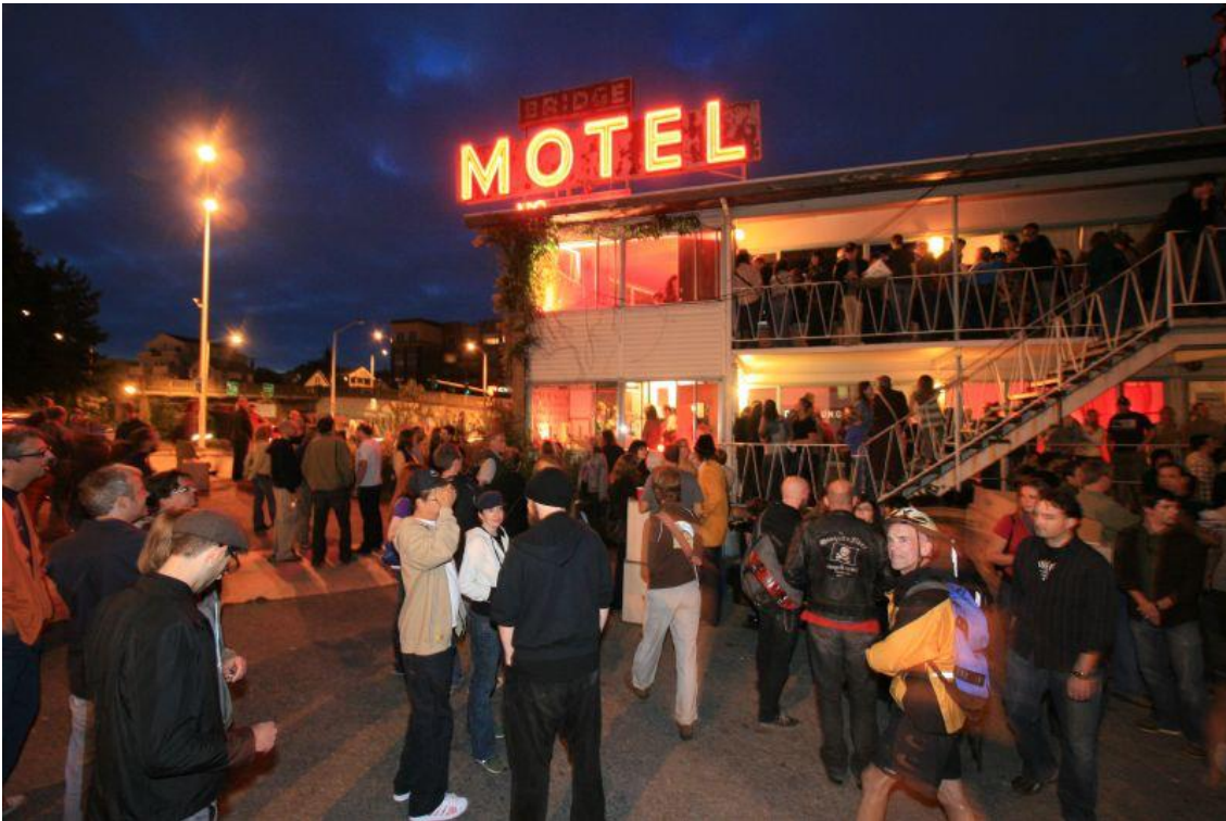
Figure 1. The Bridge Motel event on September 15, 2007.