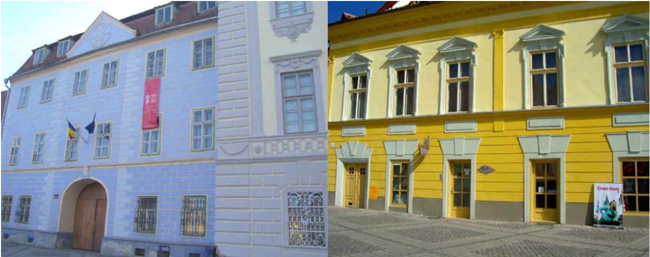
Figure 3. Renovated façades in Sibiu's historic center.

At the same time, in an interview I conducted with the communications manager for Luxembourg 2007, she said: “Rebuilding the image of Luxembourg is at the very core of Luxembourg 2007: from outside, Luxembourg is mostly seen as ‘banks,’ so we want to make something new and reactivate creativity.” As a country with one of the largest GDPs per capita in the world, Luxembourg had a budget of €7,000,000 for communication related to the European Capital of Culture alone, and focused on spreading its brand image across the city. For this reason, a plethora of steel cutouts of the whimsical Luxembourg 2007 logo, a blue deer, were strategically placed by major city buildings, in addition to the European Capital of Culture headquarters (Figure 4). The blue deer were sponsored by ArcelorMittal, the world's largest steel company with headquarters in Luxembourg, which was one of the major partners of Luxembourg 2007. In Luxembourg, the hyperbranding extended to street lighting and the 54 types of different branded products that were developed for Luxembourg 2007, with two new products being introduced every month based on the time of the year like, for example, gloves for the winter, and flip-flops for the summer.