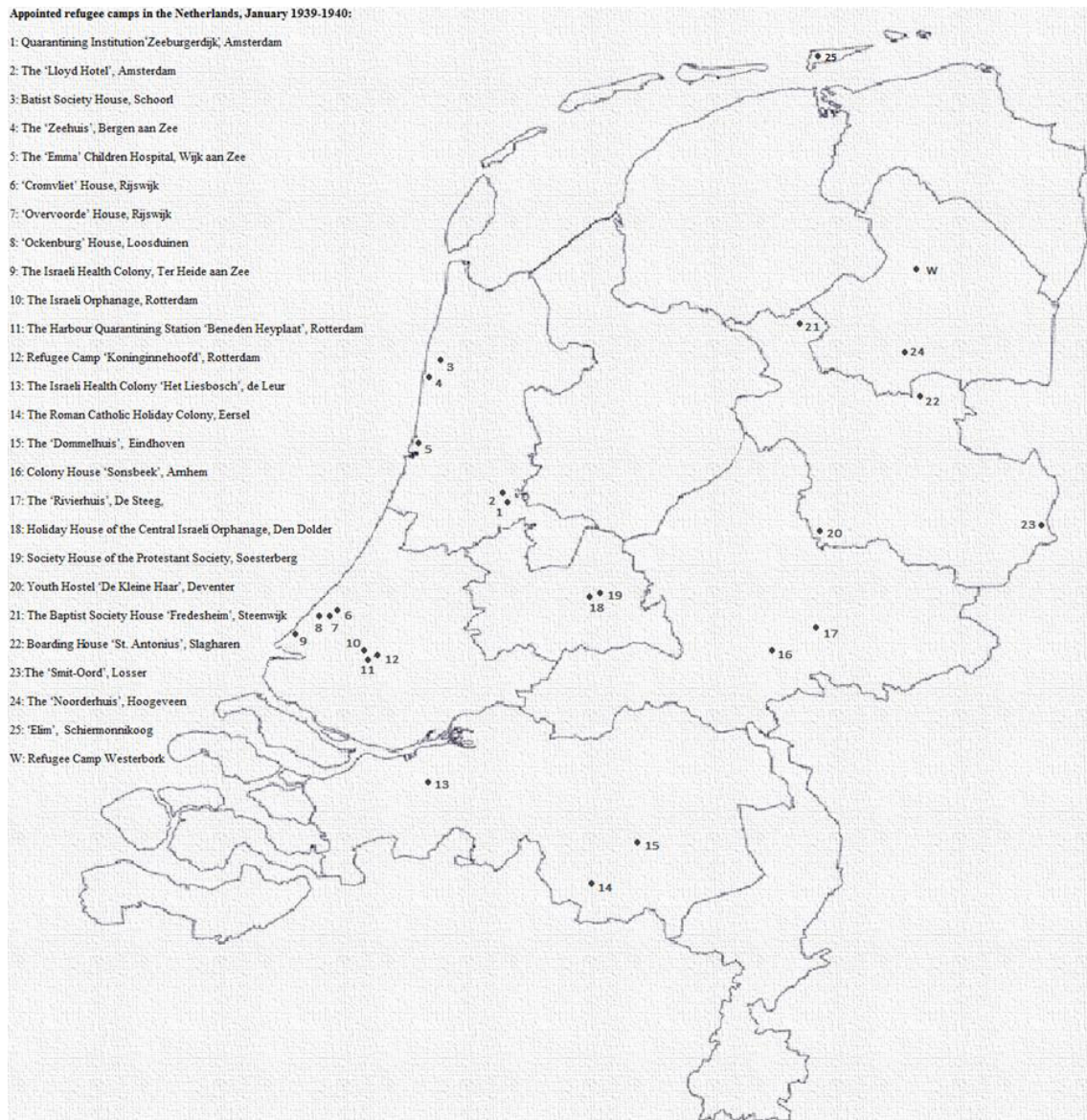
Figure 2. Map of 25 improvised refugee camps.

of national security” (Arendt, 1958:288). Arendt, in particular, reflects on the difference between the consequences of having committed an offense before the law and those of not being recognised as subject to the law. Arguably, all too often both “offenders” and refugees were treated in the framework of somewhat similar arrangements of spatial segregation, to keep them in “custody” away from the wider society via a network of prisons and (refugee) camps marked by quasi-carceral regimes of detention.