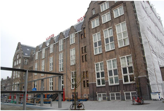
Figure 1. The Lloyd Hotel in its present form.

what we describe as a “quasi-carceral regime”. We pay close attention to the changing management of these institutions and their “guests” against the backdrop of different authorities involved and the war developments. We do so by drawing not only from recent insights coming from debates on the so-named “carceral geographies” (see Moran, 2012, 2013; Moran et al., 2012) and refugee studies in geography, and in particular their emphasis on the spatialities of the refugees, but also, crucially, their call for a closer examination of the (micro-)politics and the functioning of “the state” in relation to them (see, among others, Gill, 2010; Darling, 2011; Mountz, 2013). Such an examination of the functioning of the Dutch state furthermore contributes to an existing body of literature on Dutch refugee policies before WWII, especially on the everyday management and lived spaces of the refugees (Berghuis, 1990; Blom and Cahen, 1995; Leenders, 1993; Moore, 1986; Obdeijn and Schrover, 2008), as well as a growing body of work on the Lloyd Hotel in Amsterdam, still lacking an in-depth discussion of this specific period in the building’s past (Lubbers, 2004; Ong et al., 2014a, b).