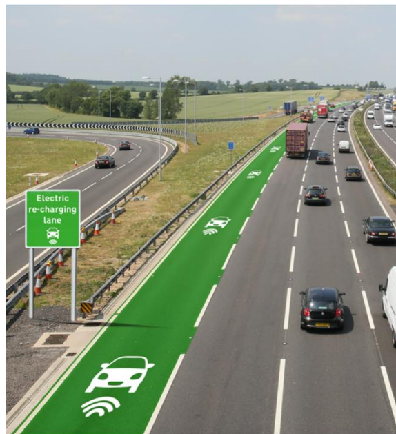
Fig. 3 Possible look of a future charging highway lane. (from: https://www.bloomberg.com/news/articles/2015-08-13/the-u-k-is-testing-high-tech-roads-that-charge-your-electric-vehicle-as-you-drive )

Clearly, the satisfaction of this balance depends on three factors: the average power absorbed by the vehicles during the journey, the rated power of the charging system, and the arrangement of the road sections equipped with the transmitter section components.