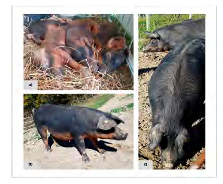
Figure 1. Mora Romagnola pigs: ( a ) piglets with the reddish and black and tan coat colours; ( b ) sow with black coat colour and reddish abdomen (black and tan) and with ears bent forward and parallel to the muzzle; ( c ) a detailed photograph of the bristle back line known as " Linea Sparta " (Sparta line).

conservation program was established, that, according to historical information, included some unregistered crossbreeding with wild boars and Duroc pigs that contributed to shape, at least in part, the current breed genetic background. Finally, the Herd Book of the Mora Romagnola breed was officially established in 2001 and the breed entered in the conservation program managed by ANAS. Estimated Ne of the breed based on molecular markers indicated a very low value, reflecting its genetic history which passed through a strong bottleneck [10,11]. Mora Romagnola pigs are small-medium sized animals, with ears bent forward and parallel to the muzzle, with a dark skin that along the lumbar region hosts black bristles forming a sort of mane ( "Linea Sparta" ) which is the other characteristic trait of the breed (Figure 1). Mono-breed pork products derived from Mora Romagnola pigs are part of an important niche value chain mainly based on a voluntary labelling system that is intrinsically linked to the conservation of this local genetic resource that can only survive due to the added value that its products can obtain at the market.