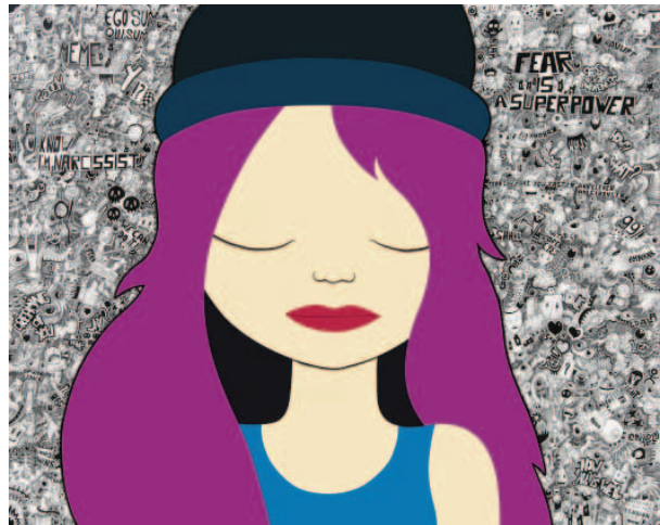
Fig. 1. Hackatao, Rez.Girl , tokenized on the SuperRare gallery. (© Hackatao)

The “dematerialization of art,” a phrase that was coined in 1967 by critics Lucy Lippard and John Chandler, identified the quintessential features of conceptual practices [3]. As Lippard later defined it, conceptual art was, essentially, “work in which the idea is paramount and the material form is secondary, lightweight, ephemeral, cheap, unpretentious and/or dematerialized” [4]. Conceptual art could be created