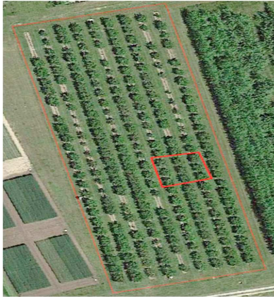
Figure 1: Satellite image of the cherry orchard, the studied trees are encased into the thick red polygon.

an average tree height of 3.2 m and 4 m distance between trees. Seasonal data have been collected at 55, 62, 65, 73 and 83 days after full bloom (DAFB), respectively. Nine clusters of cherries were analyzed per each tree ( n = 405 ) over the measuring dates. The clusters have been selected in three parts of the trees and on three heights from the ground to better characterize the distribution of the temperature in the canopy.