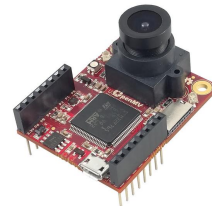
Figure 2. Deployment platform for the proposed solution. On a microcontroller platform (OpenMV Cam M7), we deploy a compact architecture made of about 100k parameters.

rate monocular depth perception system compatible with the constrained computing architectures found at the very edge. By processing low-resolution images ( e.g. , 48 \times 48 ), we can infer depth maps as shown in Figure 1 on a sub-W power envelope with the accuracy reported in Table 1.