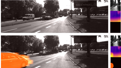
Figure 3. Simple traffic monitoring application. At the right-most position of each frame, we show, from top to bottom, the input 32 \times 32 input image, the depth map inferred by our network from it, and the output of a simple detection system working in the depth domain.

compact, with a footprint of about 100kB ( i.e. , about 100k weights, quantized to 8bit) and trained in a self-supervised manner in order to enable meaningful depth prediction, as reported in Figure 1, at about 2 FPS on the popular ARM M7 architecture ( e.g. , the OpenMV CAM M7 in Figure 2).