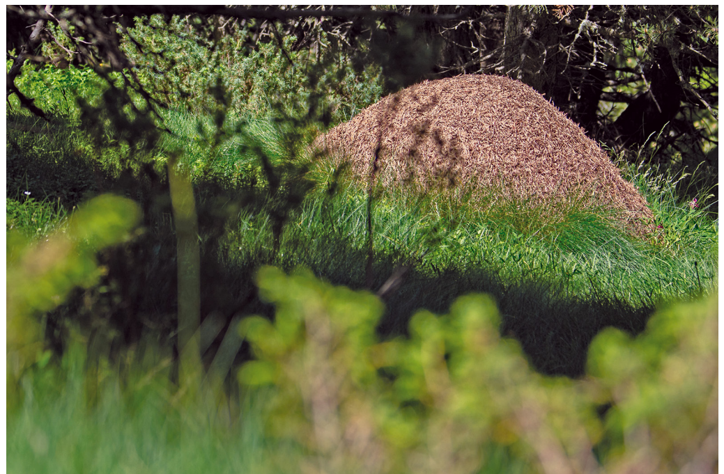
Fig. 3: Formica lugubris mound nest in the Spanish Pyrenees in which the myrmecophilic linyphiid Thyreosthenius biovatus was found