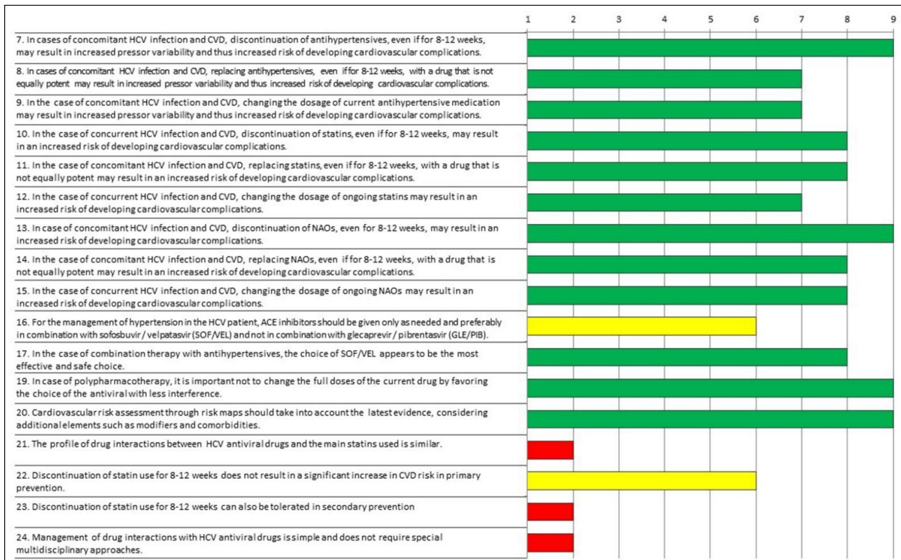
Figure 1. Appropriateness of responses to Questionnaire 1 evaluated according to the RAND/UCLA Method. Green: appropriate; yellow: uncertain; red: inappropriate.