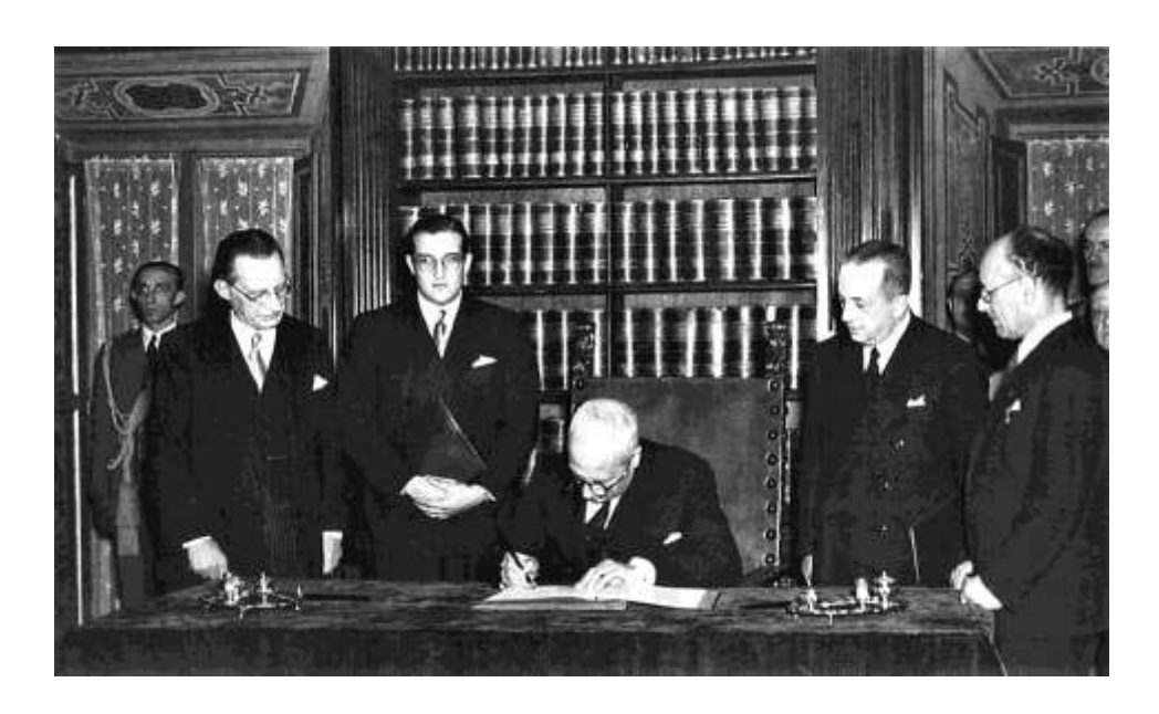
Figure 14.1 President Enrico De Nicola signs the Constitution, 1948.