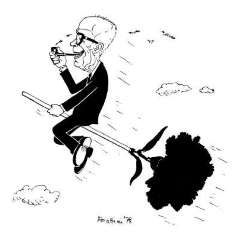
Figure 14.13 Sandro Pertini elected President. Cartoon by Forattini, La Repubblica, 1978. Scala, Florence.