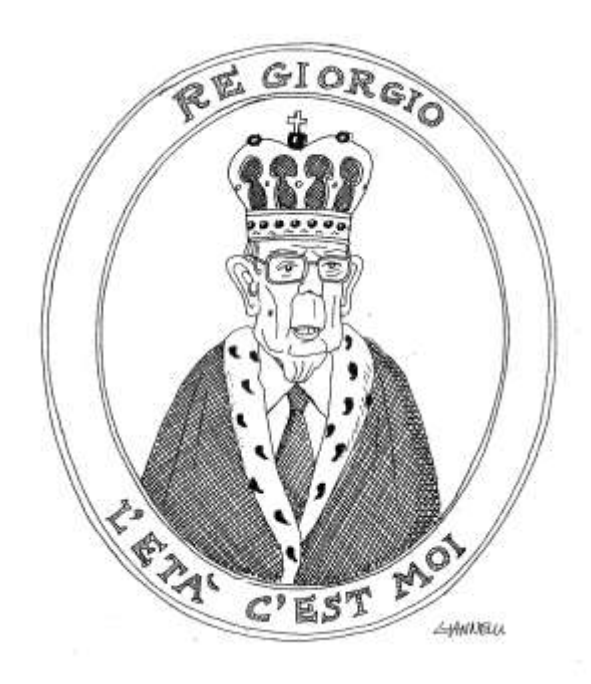
Figure 14.15 "King George, I am the State/age."