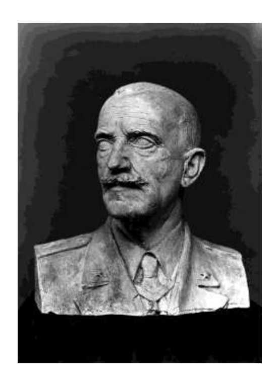
Figure 14.5 Plaster bust of King Victor Emmanuel III by Pietro Canonica, 1936, Museo Pietro Canonica, Rome..