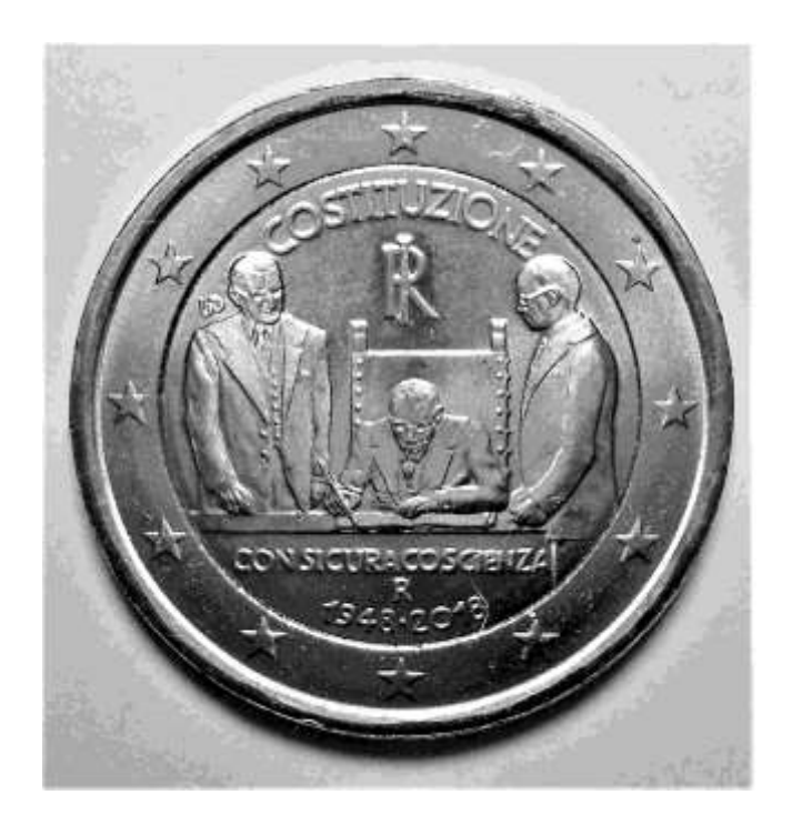
Figure 14.2 Two Euro coin, issued in 2018. The relief on the front side image is based on the photograph in Fig. 14.1.