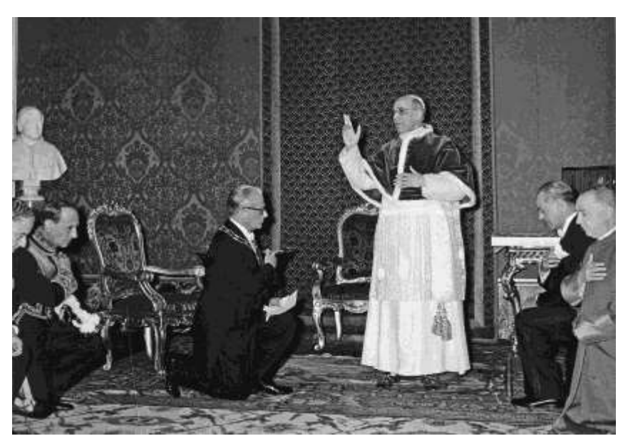
Figure 14.7 President Gronchi kneeling before Pope Pius XII, during a state visit to the Vatican, 1955.