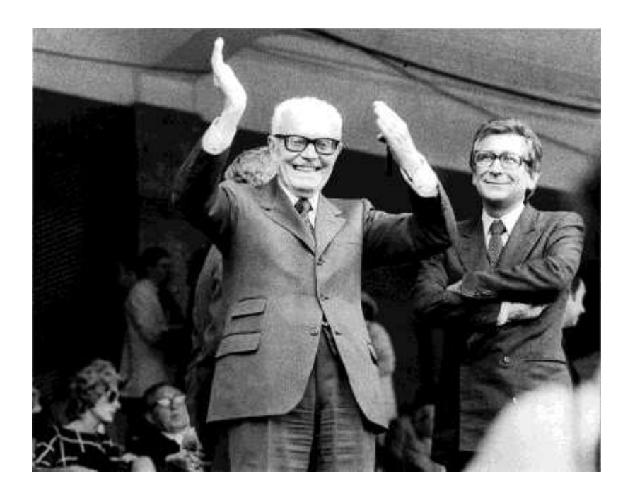
Figure 14.12 Sandro Pertini rejoices at Italy's victory at the World Cup, 1982.