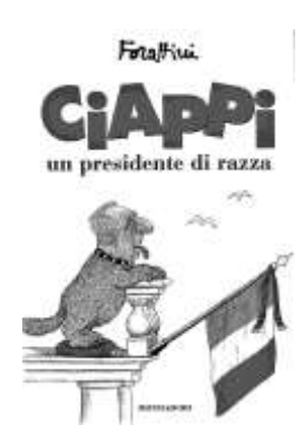
Figure 14.14 "Ciappi, a pedigree President." Cartoon by Forattini, La Repubblica, 2002. Fig. 14.17: "King George, I am the State/age." Cartoon by Giannelli, Il Corriere della Sera, 2013.