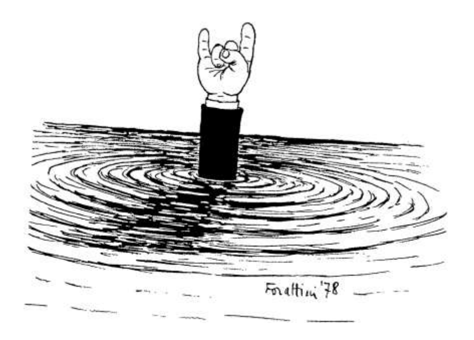
Figure 14.11 "[President] Leone resigns." Cartoon by Forattini, La Repubblica, 1978.