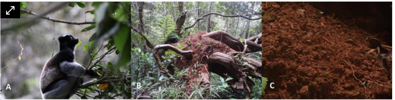
A: Indri indri; B: geophagic soil on the roots of a fallen tree; C: geophagic soil.

The mammalian gut hosts a wide community of beneficial commensal microorganisms. Among these, two groups of organisms, bifidobacteria and lactobacilli, are commonly associated with health-promoting activities including a strengthened intestinal barrier, immune response modulation, and production of antimicrobial compounds. Some lactic acid bacteria are adapted to grow in plants with abundant phenolic compounds. Specifically, Lactiplantibacillus plantarum metabolizes phenolic compounds better than other bacterial groups, supporting the hypothesis that intestinal microorganisms may help decrease the potential adverse effects of phenolic compounds introduced with the diet.