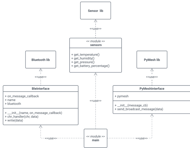
Fig. 2. Class diagram of the micropython code executed in the fipy

The creation of the LoRa-mesh network is managed by the software modules depicted in Fig. 2.