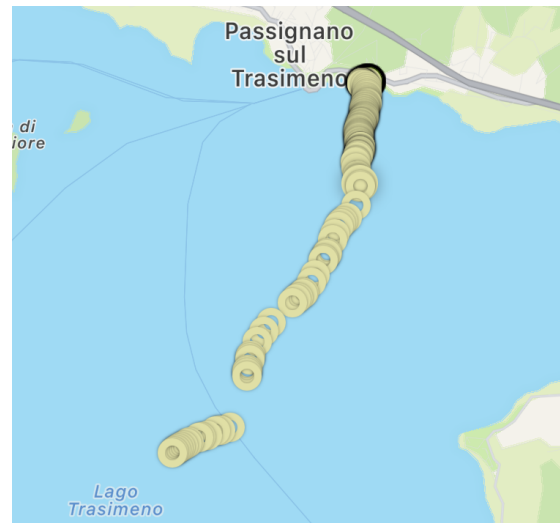
Fig. 3. image of the route of the boat used for the test (boat data received by the ground node)

RSSI is measured in dBm and is a negative value. The closer it is to 0, the better the signal. Typical values of LoRa RSSI are [14]: Min RSSI = -120 dBm; RSSI= -30dBm: strong signal; RSSI= -120dBm: weak signal. All tests were carried out with a transmission power of 14 dBm.