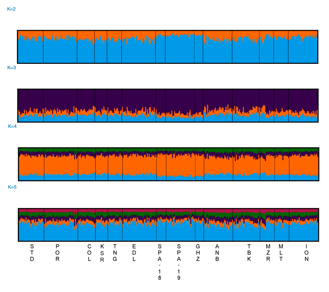
Figure 3. Summary plot of the STRUCTURE analysis from K = 2 to K = 5. Each individual is represented by a single vertical line on the x-axis. Coloured segments represent the membership of individuals in the population clusters. Results are shown for the 14 locations using 14 microsatellite loci.

The results from STRUCTURE were analysed using the LnP(D) trend to evaluate the best K according to STRUCTURE HARVESTER. The plot did not show the expected plateau usually displayed when a population structure is present (Figure S3). The plot showed an increase in LnP(D) variance between runs in relation to the increase in K (Figure S3). Individual bar plots grouped from K = 2 to K = 5 clusters (Figure 3) showed an admixed genetic component across all the investigated locations.