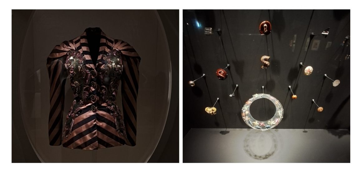
Figure 3: a. Veste du soir , Collection printemps 1947 by Elsa Schiaparelli; b. Collection of buttons 1936–1939 and a neckless, 1938 by Jean Clemént