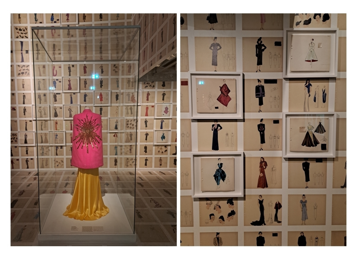
Figure 1: Shocking! The Surreal Worlds of Elsa Schiaparelli, exhibition entrance with selection of unsigned sketches dating from 1933 and 1953, part of the UFAC collection.