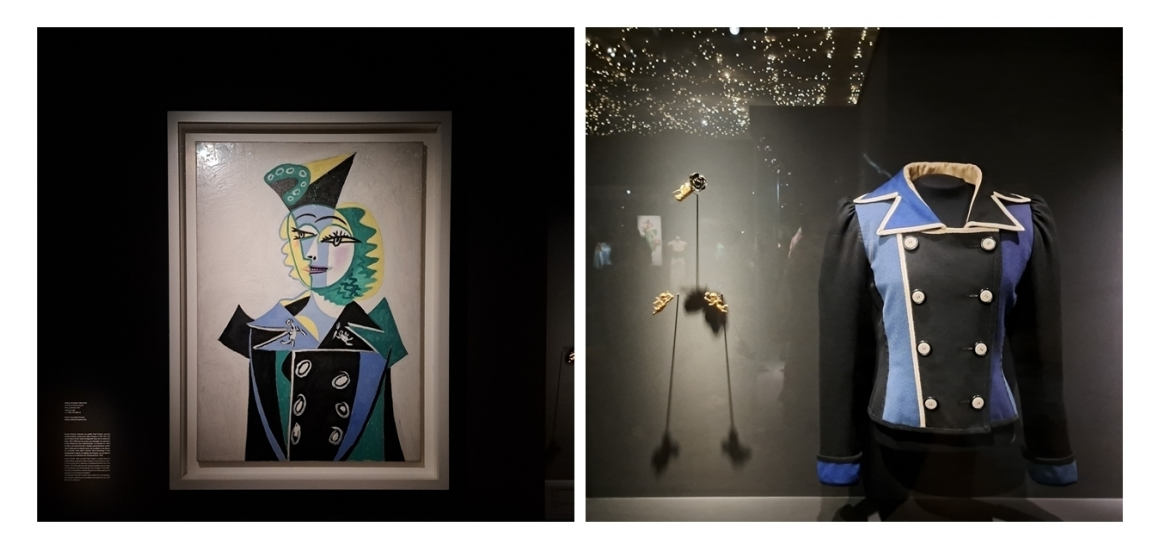
Figure 6: a. Portrait de Nusch Éluard , Paris, 1937 by Pablo Picasso; b. Jacket Hommage à Pablo Picasso designed by Yves Saint Laurent for the A/W 1979 collection