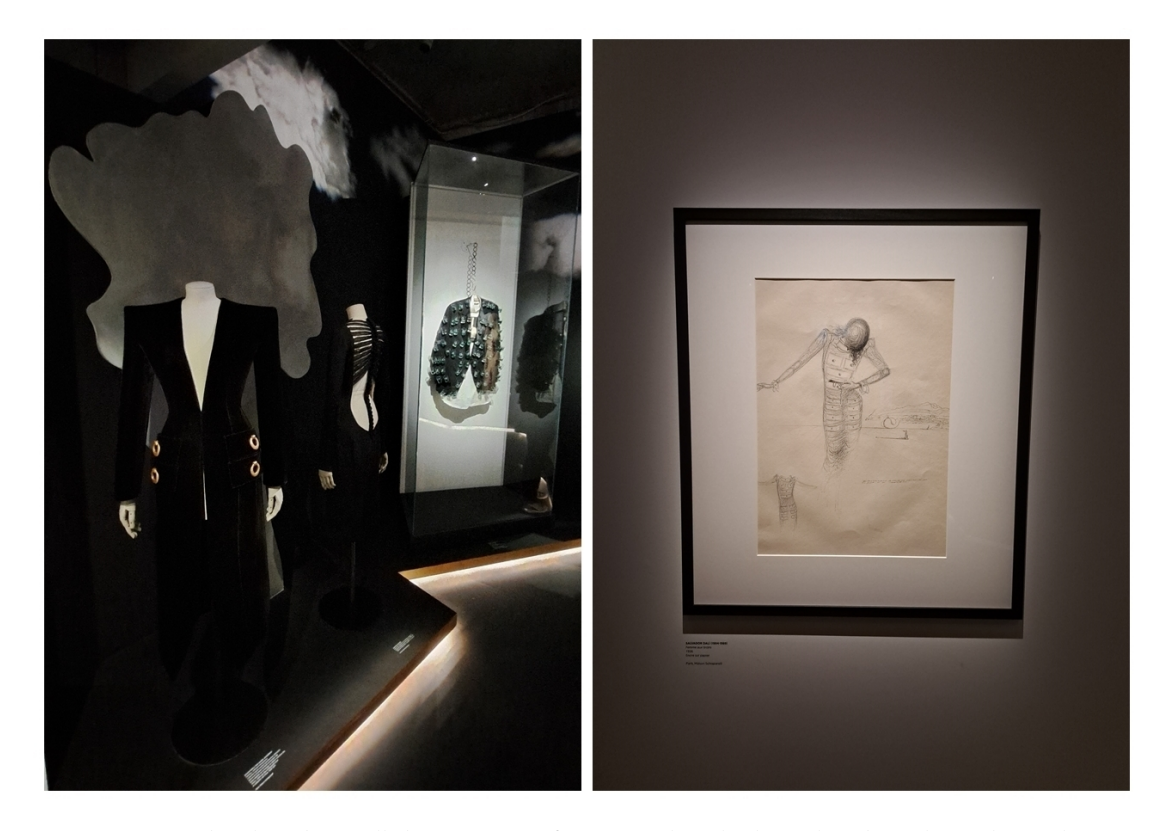
Figure 7: a. Dress by Elsa Schiaparelli; b. Femme aux firoirs, 1936 by Salvador Dalí