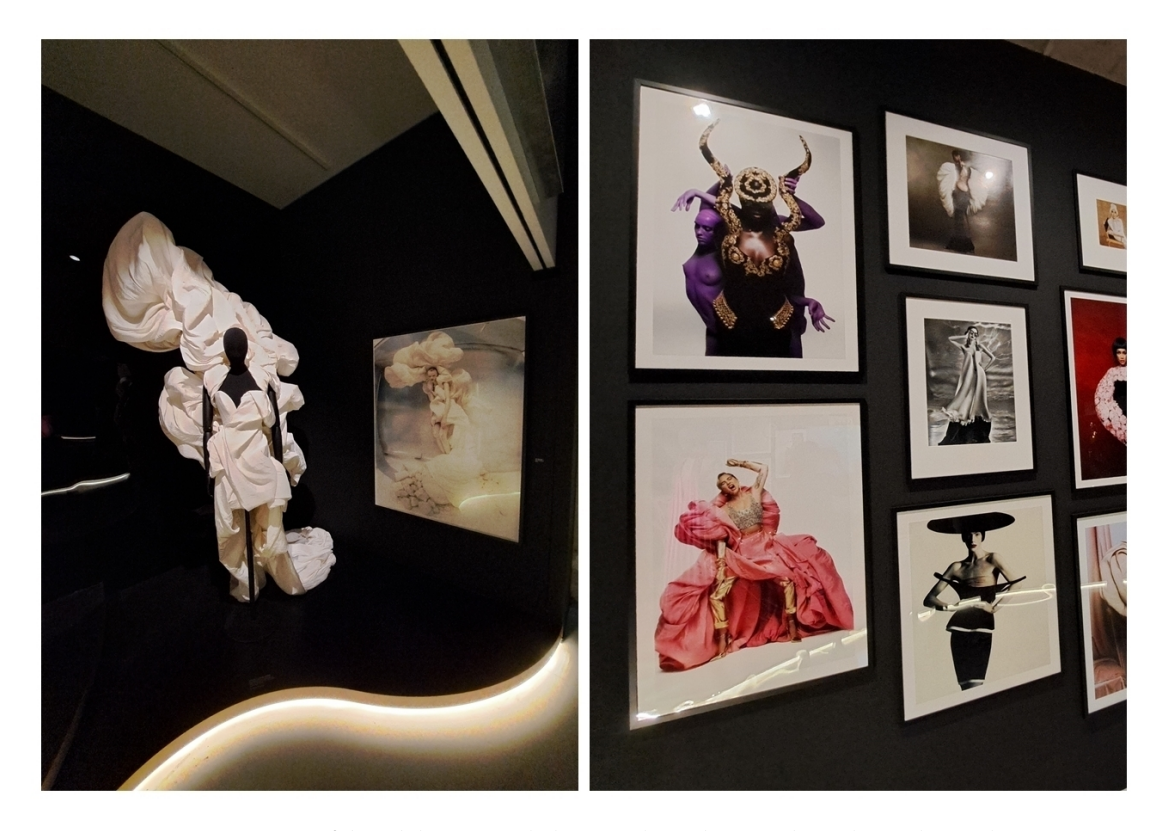
Figure 4: Last section of the exhibition, works by Daniel Roseberry