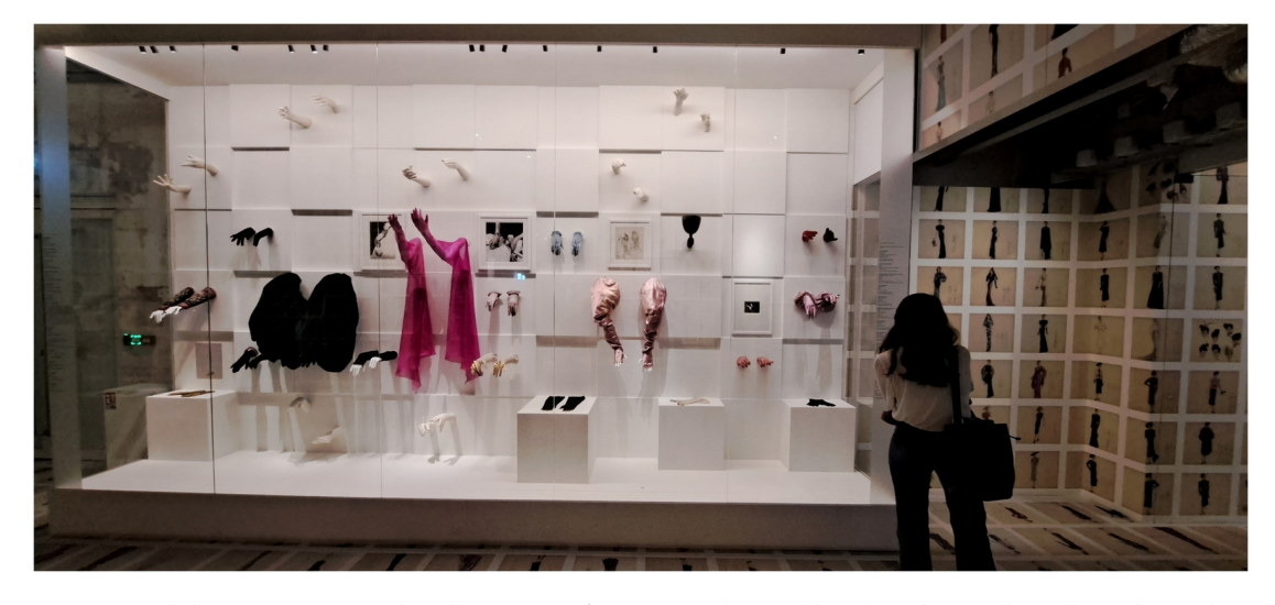
Figure 2: Exhibition entrance with wall selection of accessories designed by Elsa Schiaparelli.