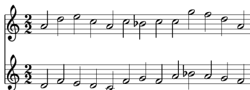
Fig. 5. An example of a two voices counterpoint. The lower voice is the cantus firmus, while the upper voice has been generated by applying a sequence of intervals generated by our algorithm.

point. In particular the rules extracted that have more strength are: incipit with a perfect consonance (unison, octave or fifth), no consecutive octaves or fifths, and dissonant intervals followed by consonant ones—both perfect and imperfect. In Fig. 5 we show an excerpt of the counterpoint produced by applying one of the sequences generated by our algorithm to a given cantus firmus (Chanson CXXVI from manuscript Bibl. Nat. Fr 12744 published by G. Paris). As the algorithm returns a sequence of intervals, it could be used as a tool that assists composers by suggesting feasible note choices, once one of the two voices ( cantus firmus ) is given.