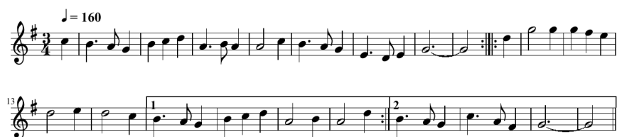
Fig. 1. Score of a well known traditional air titled “The south wind”.

Traditional Irish music is strongly characterized by its melodies: most old tunes are just melodic (see e.g. [34]) or they are the result of an improvisation upon a given ground , i.e. a bass line providing also a harmonic base (see e.g. [28]). In any case, the melodic part of a traditional Irish music is currently the most important component and melodies are usually played with variations, improvising upon a given melodic structure. A large corpus of traditional Irish airs is available in abc notation, 2 which makes it possible to extract melodies as sequences of symbols, each representing both note and duration. A typical traditional Irish air is shown in Fig. 1. From these airs we extracted all the ones in the key of G and assigned one symbol to each \langle \text{note}, \text{duration} \rangle pair.