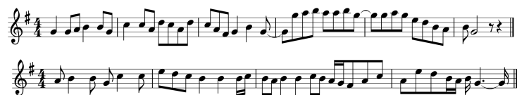
Fig. 4. Two typical excerpts of automatically created Irish music.

Due to limited space we can just provide a few examples of the musical results obtained. The generation of melodies inspired to traditional Irish airs has been evaluated by sampling some weight vectors from the final populations and using them to generate actual music. By analyzing the results both through visual inspection and by listening to them, we observed that the music generated is similar to the repertoire provided but with variations and recombinations of patterns. A couple of excerpts are shown in Fig. 4, where we can observe variations of typical Irish melodic and rhythmic patterns: the characteristic run (i.e. a fast sequence of notes, typically in a scale) in bars 4, 5 of the first example and the syncopated and composite rhythm in the second one.