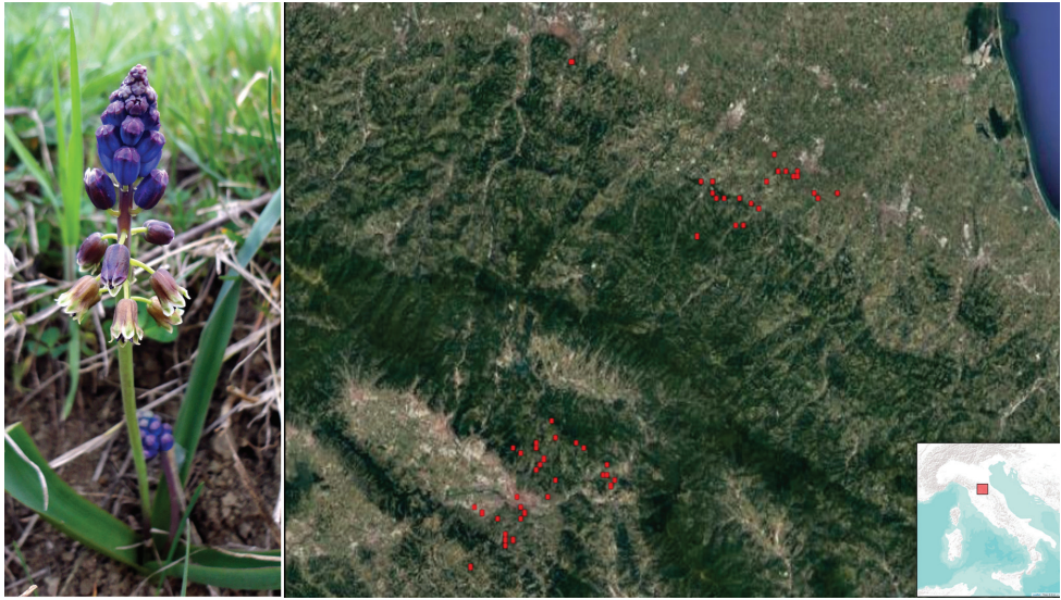
Figure 1. Webb's hyacinth ( Bellevalia webbiana ): general habit of the plant in flower from Vaglia, loc. Pratolino (Firenze), March 25, 2017 (left); detailed distribution expressed as 1×1 km grid cells and its localisation in Italy, North is upwards (right).

of the target species (Fig. 1). The study area was selected based on the known range of the species, corresponding to two relatively small and disjunct sites of Central Italy. This territory, located inside longitude 10.99–11.94 E and latitude 43.65–44.39 N (Fig. 1), covers an area of 3,192.37 km 2 and is characterised by a large absence area in correspondence of the Apennine mountain ridge, along the direction NW-SE.