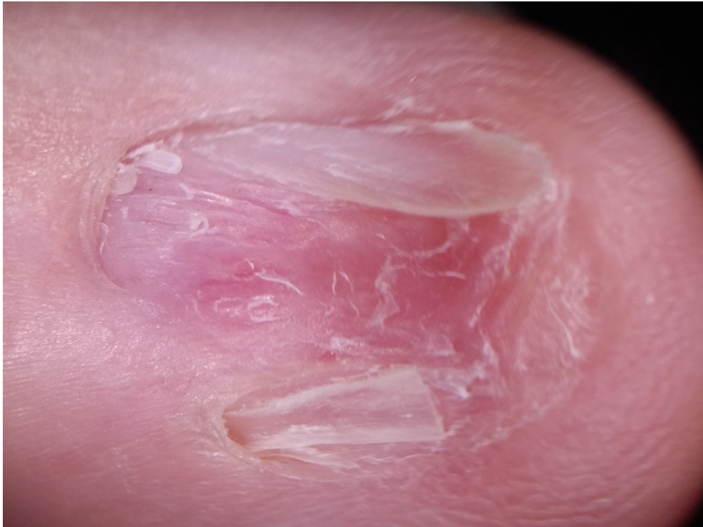
Figure 2. Dorsal pterygium

1 2 3 4 5 6 7 8 9 10 11 12 13 14 15 16 17 18 19 20 21 22 23 24 25 26 27 28 29 30 31 32 33 34 35 36 37 38 39 40 41 42 43 44 45 46 47 48 49 50 51 52 53 54 55 56 57 58 59 60