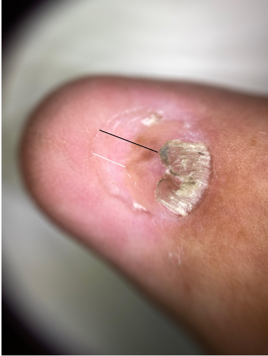
Figure 3. Nail plate retraction (black line) and nail bed retraction "Disappearing nail bed" (white line)

1 2 3 4 5 6 7 8 9 10 11 12 13 14 15 16 17 18 19 20 21 22 23 24 25 26 27 28 29 30 31 32 33 34 35 36 37 38 39 40 41 42 43 44 45 46 47 48 49 50 51 52 53 54 55 56 57 58 59 60