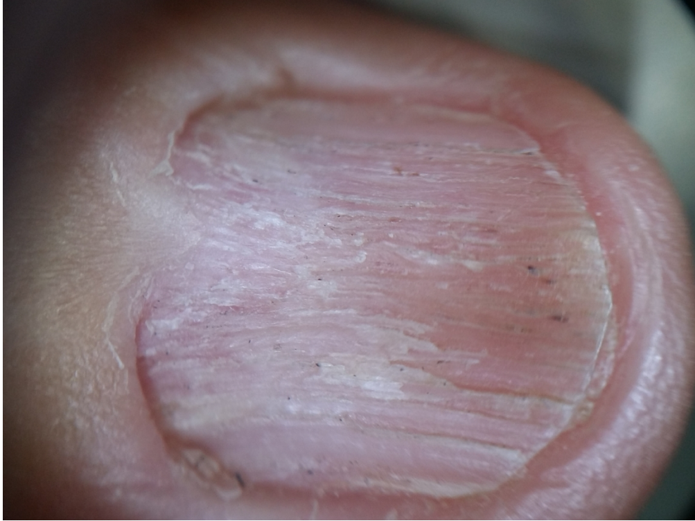
Figure 4. Bulge

1 2 3 4 5 6 7 8 9 10 11 12 13 14 15 16 17 18 19 20 21 22 23 24 25 26 27 28 29 30 31 32 33 34 35 36 37 38 39 40 41 42 43 44 45 46 47 48 49 50 51 52 53 54 55 56 57 58 59 60