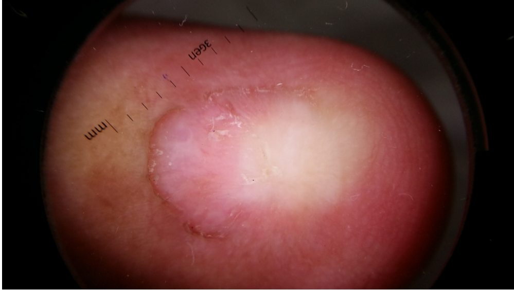
Figure 1. Anonychia