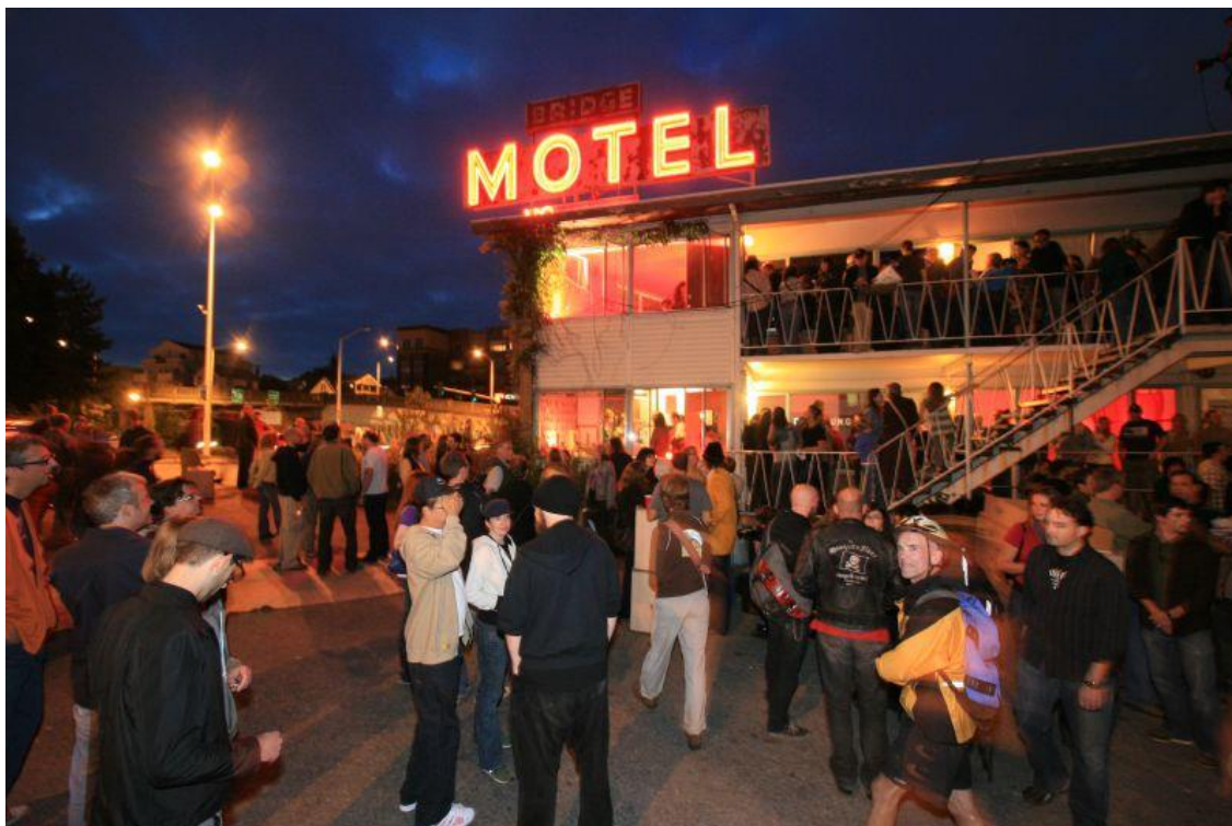
Figure 1. The Bridge Motel event on September 15, 2007.