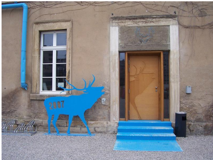
Figure 4. Steel cutout of the Luxembourg 2007 logo by the city's European Capital of Culture headquarters.

At the same time, in an interview I conducted with the communications manager for Luxembourg 2007, she said: “Rebuilding the image of Luxembourg is at the very core of Luxembourg 2007: from outside, Luxembourg is mostly seen as ‘banks,’ so we want to make something new and reactivate creativity.” As a country with one of the largest GDPs per capita in the world, Luxembourg had a budget of €7,000,000 for communication related to the European Capital of Culture alone, and focused on spreading its brand image across the city. For this reason, a plethora of steel cutouts of the whimsical Luxembourg 2007 logo, a blue deer, were strategically placed by major city buildings, in addition to the European Capital of Culture headquarters (Figure 4). The blue deer were sponsored by ArcelorMittal, the world's largest steel company with headquarters in Luxembourg, which was one of the major partners of Luxembourg 2007. In Luxembourg, the hyperbranding extended to street lighting and the 54 types of different branded products that were developed for Luxembourg 2007, with two new products being introduced every month based on the time of the year like, for example, gloves for the winter, and flip-flops for the summer.