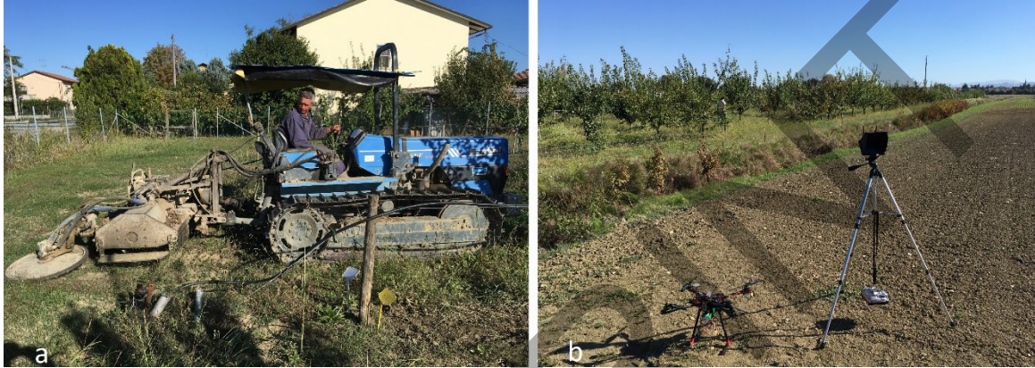
Figure 2. a) Grass mulcher that operates inter row; b) Custom built drone equipped with MAPIR Survey 3N NDVI camera

In order to measure the PTO torque, a NCTE 7000 torquemeter (NCTE AG, Germany) with a full scale of 3000 Nm was installed between the tractor PTO and the implement. Moreover, the tractor was equipped with a CANcaseXL CAN logger (Vector Informatik GmbH, Germany) in order to acquire actual engine power and fuel consumption. The speed of the tractor was measured with an IPESpeed GPS receiver (IPETronik GmbH, Germany) connected to the previously presented CAN logger. A Landini Trekker 55F (Argo tractor S.p.A., Italy) with a maximum power of 39 kW and a weight of 2830 kg equipped with a grass mulcher operating inter-row were used to compare the weed control efficiency. A custom built flying drone equipped with a Mapir Survey 3N NDVI camera (Mapir Camera, USA) was used to capture aerial images of the orchard before and after the treatments (Figure 2).