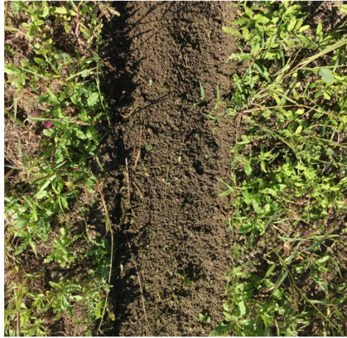
Figure 5. Picture of an inter row after the treatment performed with the Grass Killer taken the 27 th September 2018.

The results of the One-Way Anova test reported in Table 4 show that there were not significant differences between the two side of the inter rows before the treatments. The mean value of the inter row NDVI indices mean values were 0.347 and 0.376 for the grass mulcher and for the Grass Killer respectively.