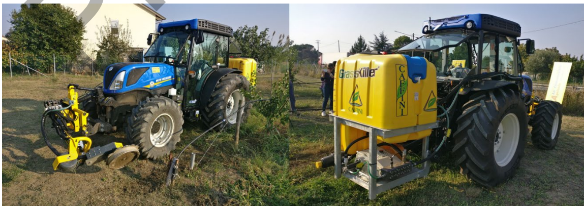
Figure 1. New Holland T4.110LP and Caffini Grass Killer

Test were carried out in an apricot orchard owned by Martorano 5 farm located in Martorano di Cesena (Cesena, Italy). The tested Grass Killer (Caffini S.p.a, Italy) was the 1000 l water tank version with only one rotating inter row disc with nozzles. The implement was mounted on a New Holland T4.110LP tractor with a maximum engine power of 79 kW and a weight of 2900 kg (Figure 1).