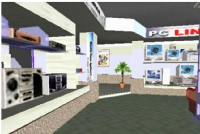
Fig. 3. Virtual-Reality-based store in Lee and Chung (2008).