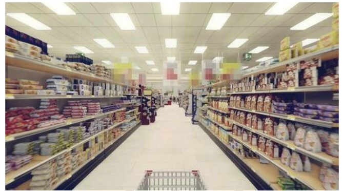
Fig. 5. Virtual Reality in the present research.