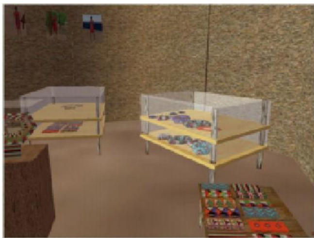
Fig. 4. Virtual-Reality-based store in Huang et al. (2016).