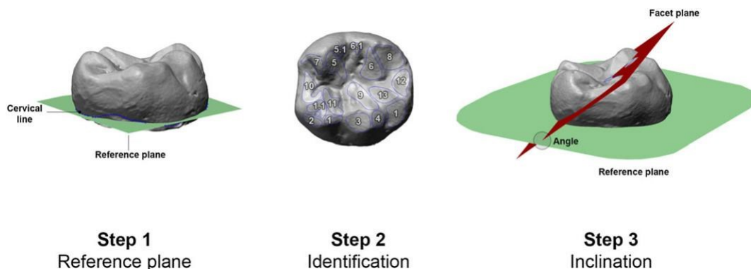
FIGURE 1 Occlusal fingerprint analysis method: Computation of a reference plane along the cervical line (Step 1), wear facet identification (Step 2) based on Maier and Schneck (1981) labelling system, and inclination, measured between the reference and facet plane (Step 3). Buccal Phase I wear facets (Facets 1, 1.1, 2, 2.1, 3, and 4); Lingual Phase I wear facets (Facets 5, 5.1, 6, 6.1, 7, and 8); Phase II wear facets (Facets 9, 10, 11, 12, and 13) [Colour figure can be viewed at wileyonlinelibrary.com ]

The computation of a reference plane (Step 1) is based on the use of a reference Cartesian xy-plane created along the cervical line of each individual tooth by means of the least square best-fit method (Fiorenza et al., 2010; Kullmer et al., 2009; Ulhaas et al., 2007). Wear facets were manually identified and segmented (Step 2) on the surface of the 3D models using the polyline tool of Polyworks® V12 (InnovMetric software). In order to create the plane of each facet, we selected all triangles contained in the facet perimeter and used the best-fit plane function; the inclination (Step 3) is the angle measured between the facet and the reference plane (Kullmer et al., 2009).