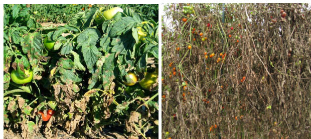
Figure 2. Defoliation caused by early blight on tomato plant.