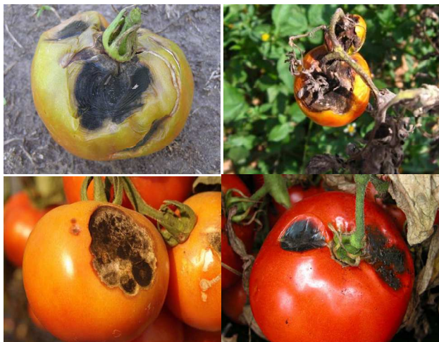
Figure 4. Early blight rot symptoms on tomato fruit.