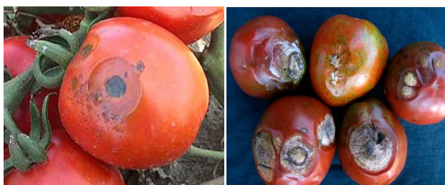
Figure 16. Anthracnose tomato fruit rot.