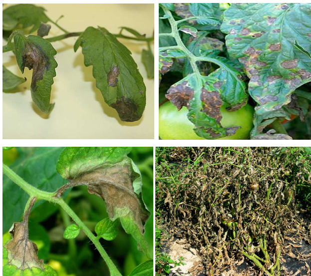
Figure 7. Late blight symptoms on tomato leaflet.

Late blight is caused by the fungus Phytophthora infestans and usually appears in mid- or late August. The fungus is a wet weather disease favored by cool nights and warm days. Temperatures above 30°C are considered unfavorable for late blight development. The fungus survives mainly in potato seed tubers and in infected tomato transplants. Some survival may also occur in dead potato and tomato vines. The disease often begins in potato plants, from which spores of the fungus are blown by wind to infect tomatoes in favorable conditions. Disease development is rapid with extended periods of favorable conditions and ceases when weather becomes hot and dry. Usually, the warm to hot temperatures prevailing during periods of tomato production make the occurrence of this disease unlikely. However, the disease could be a potential problem during unseasonably cool and wet conditions on early-planted or fall-cropped tomatoes.