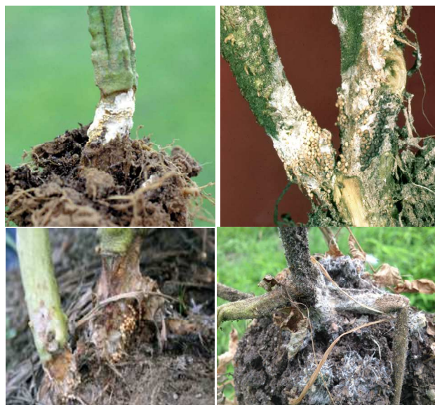
Figure 20. White mycelia at the base of infected tomato plants, small round sclerotia of Sclerotium rolfsii .

Sclerotium rolfsii produces survival structures called sclerotia, which are small (0.04-0.08 inches) that enable the fungus to survive for many years in soils, even through adverse conditions [34]. Sclerotia are first white, later becoming dark brown spherical structures or orange color. When Sclerotia is fully developed, each sclerotium is about mustard seeds size. The presence of the white mycelium and sclerotia at stem base of affected plants are very useful characteristics for identifying southern blight [35, 36]. The fungus survives in the soil as sclerotia which may build to high numbers when susceptible plants are cropped repeatedly.