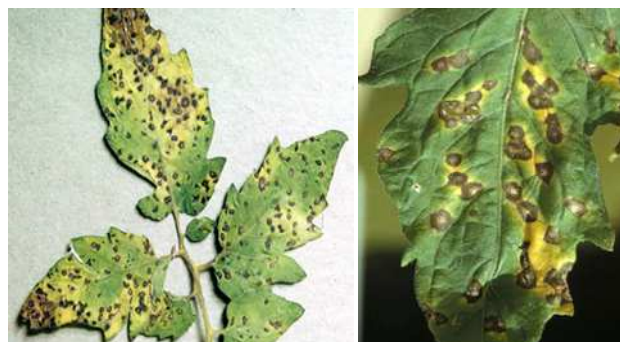
Figure 6. Septoria tomato leaf spot; the light-colored centers.