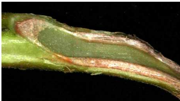
Figure 13. Verticillium wilt symptoms of cut stem in tomato plant.