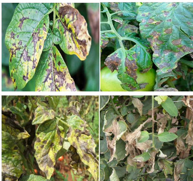
Figure 1. Foliar symptoms of tomato early blight.

Premature loss of lower leaves is the most obvious symptom of the disease [4]. Infected leaves show brown to black spots (lesions) up to 1/2 inch diameter with dark edges and have a pattern of concentric rings resulting in the “target” appearance to the spot suggested by the common name (Figure 1) [5]. Later, spots frequently merge forming irregular blotches [6]. Defoliation progresses upward from the lower plant and infected leaves eventually turn brown and drop from the plant exposing the fruits to sun scald (Figure 2) [7]. Dark lesions on the stems start off small and slightly sunken. As they get larger, they elongate and you will start to see concentric markings like the spots on the leaves (Figure 3) [8]. Spots that form near ground level can cause some girdling of the stem or collar rot. Plants may survive, but they will not thrive or produce many tomatoes [9]. Early blight generally attacks older plants, but it can also occur on seedlings. If early blight gets on the seedlings, affected seedlings will have dark spots on their leaves and stems [10, 11].