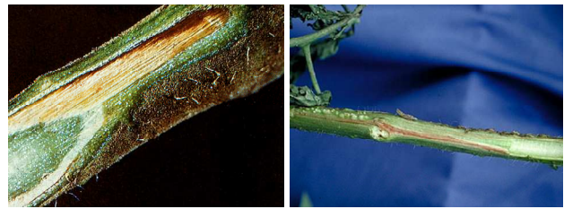
Figure 11. Vascular browning caused by Fusarium wilt on tomato stem.