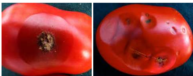
Figure 15. Fruiting bodies at the center of the lesion on ripe tomato fruit.