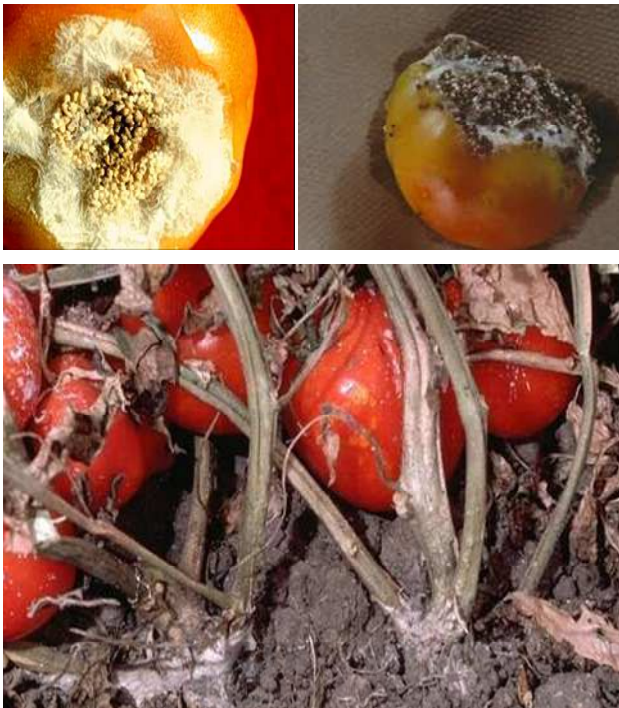
Figure 21. Mycelia and sclerotia of Sclerotium rolfsii on tomato fruit.

After sclerotia germinate, the fungus must first colonize organic debris near the soil surface before the fungus can cause infection. Early symptoms on fruit are circular water-soaked spots followed by soft rot or decay (Figure 21).