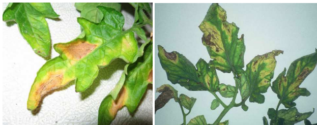
Figure 12. Verticillium wilt foliage symptoms on tomato plant.

Wilt caused by this disease may be differentiated from drought-stress based on the portion of the plant that is wilting and on the location of wilted plants. Diseased plants often have only a portion of the plant wilting, such as one or two stems. In addition, diseased plants usually appear in patches within the growing area. Plants suffering from drought, however, are uniformly wilted and occur throughout the growing area.