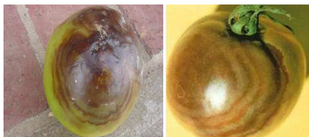
Figure 17. Brown concentric rings caused by buckeye rot on tomato fruit.

The initial symptom on the fruit is a grayish green or brown watersoaked spot that usually appears near the blossom end, or at the point of contact between the fruit and soil [28]. The spot further enlarges and develops into a lesion with a characteristic target-like pattern of concentric rings of narrow dark brown and wide light brown bands that resemble the markings on a buckeye (Figure 17) [29]. Fruit symptoms caused by buckeye fruit rot can be confused with symptoms of “late blight,” which is caused by the fungus Phytophthora infestans [30]. Buckeye fruit rot lesions are at first firm and smooth surface and lack a sharply defined margin, whereas late blight lesions are typically rough and sunken at the margins. Buckeye fruit rot may produce a white, cottony fungal growth on the lesion under moist conditions (Figure 18) [31]. The buckeye rot fungus can affect both green and ripe fruit. Diseased fruit are usually located nearest the ground in staked tomatoes.