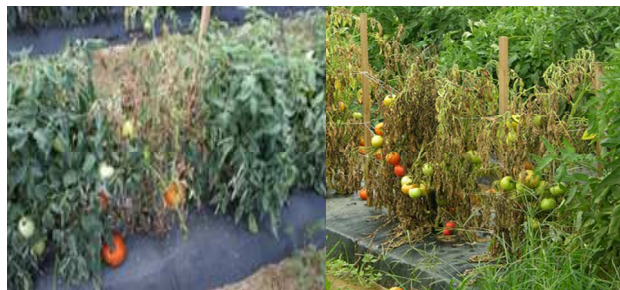
Figure 19. Southern blight on tomato plants.

rapidly expands, turns brown, and girdles the stem (Figure 20) [33]. The fungus produces white fungal strands (mycelia or hyphae) around infected stem and can be observed on the soil surrounding the plant (Figure 20).