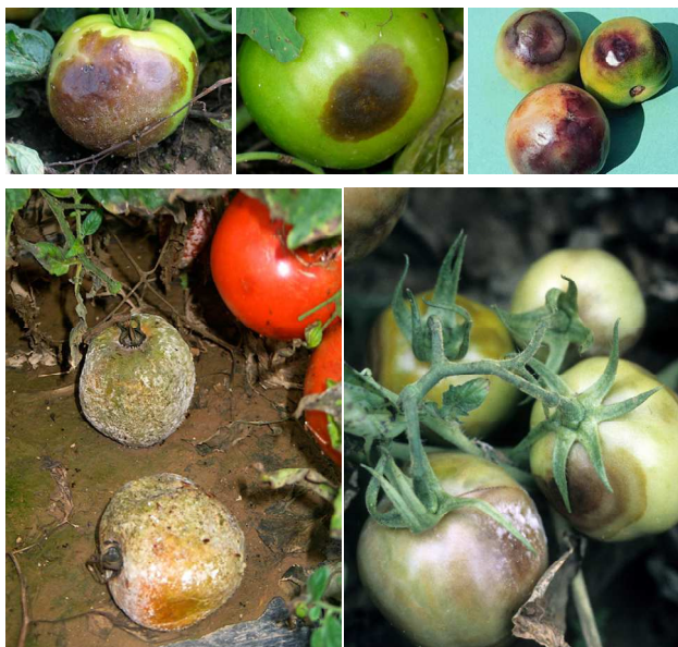
Figure 18. Buckeye rot fungus affect both green and ripe tomato fruit.