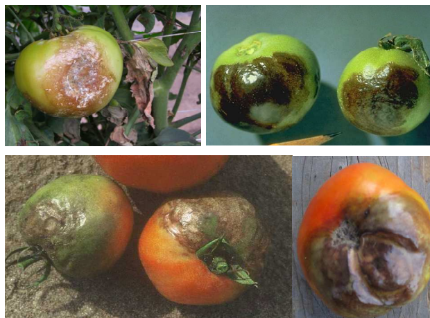
Figure 9. Tomato fruit rot caused by late blight.

All parts of the plant are affected and fruit decay can be severe. Late blight may infect either young (upper) or old (lower) leaves. It first appears as pale green water-soaked spots starting at leaf tips that enlarge rapidly, forming irregular, greenish black blotches (Figure 7) that expand rapidly when leaves are wet or humidity is high [13]. White mold usually develops at the margins of affected areas giving the plant a frost-damaged appearance. Entire plants may be rapidly defoliated when conditions favor the disease (Figure 7). If stems and petioles are infected, brown streaks along the stems will be presented and the areas above these infections wilt and die (Figure 8) [13]. Infection of green or ripe fruit produces large, irregularly shaped brown blotches that usually start at the stem (Figure 9). Infected fruits rapidly deteriorate into foul-smelling masses.