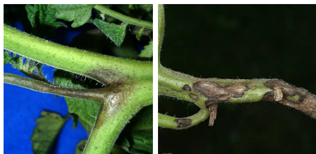
Figure 3. Early blight of tomato stem.

They may even develop the disease on their cotyledon leaves. Basal girdling and death of seedlings may occur. This manifestation of the disease is called collar rot [12]. Early blight can infect plants at any stage during the growing season but usually progresses most rapidly after plants have set fruit (Figure 4) [13]. Green or red fruit may be infected by the fungus which invades at the point of attachment between the stem and fruit, and through growth cracks and wounds made by insects. Dark lesions enlarge in a concentric fashion and may affect large areas of the fruit. Mature lesions in fruit are typically covered by a black velvety mass of fungal spores.