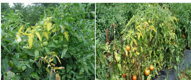
Figure 10. Tomato Fusarium wilt.

Plants are susceptible at all stages of development, but symptoms are most obvious at or soon after flowering. Diseased plants first develop a yellowing of the oldest leaves (those nearing the ground). The bright yellowing which is restricted to one side of the plant or even to leaflets on one side of the petiole is considered as a recognized characteristic of tomato Fusarium wilt (Figure 10) [16]. The affected leaves soon wilt and dry up but they remain attached to the plant. The wilting continues successively on younger foliage and eventually results in the death of the plant. The stem remains firm and green on the outside but exhibits a narrow band of brown discoloration in the vascular tissue (Figure 11) [17]. This discoloration can be viewed easily by slicing vertically through the stem near the soil line and looking for a narrow column of browning between the central pith region (middle tissue of the stem) and the outer portion of the stem. The brown streaking in the vascular tissue of infected plants becomes plugged during the attack by the fungus, leading to wilting and yellowing of the leaves. Infected plants often die before maturing.