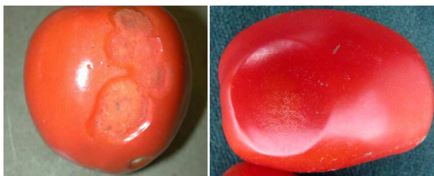
Figure 14. Circular sunken lesions on ripening tomato fruit caused by anthracnose .

Despite all this apparent destruction, Colletotrichum is considered a weak pathogen and can often be controlled through good cultural practices [25]. The pathogen overwinters on infected plant debris, so it is very important to dispose of rotten fruit and infected plants. Because of the ability of this fungus to persist in the soil, tomatoes and other solanaceous crops, like peppers and eggplants, should be rotated on an every-other-year basis [26].