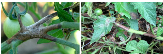
Figure 8. Brown streaks along the tomato stems caused by late blight.