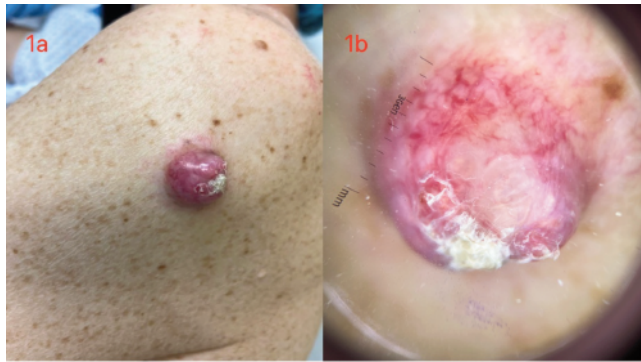
Figure 1. a) A pink nodule with telangiectasias and a central white crust on the left arm of the patient; b) dermoscopy showing a pink background with milky-red areas, irregular polymorphic vessels, including branching out of focus vessels, white structures and the presence of the white crust at the center of the nodule (Dermlite DL3).

the sebaceous differentiated component were consistent with a secretory variant of sebaceous carcinoma, according to the paper of Misago et al. 2 On the contrary, the presence of marked atypia within the spindle cell component and the presence of a high